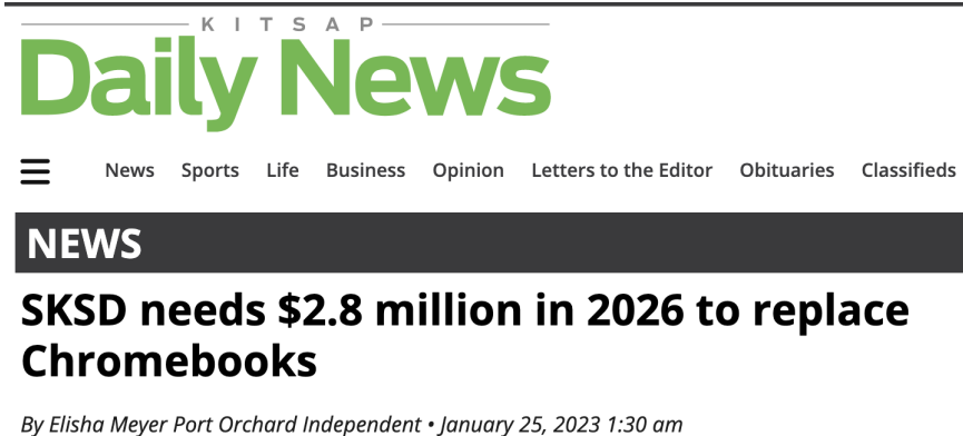
Figure 2. Headline from Kitsap Daily News

Now, some three years after that huge spike in Chromebook sales – over 31 million units sold in that first year of the pandemic 12 – schools are beginning to see their Chromebook fleets fail. This is the dark side to Chromebooks: they don’t last as long as they should, and have unique challenges to fixing them.