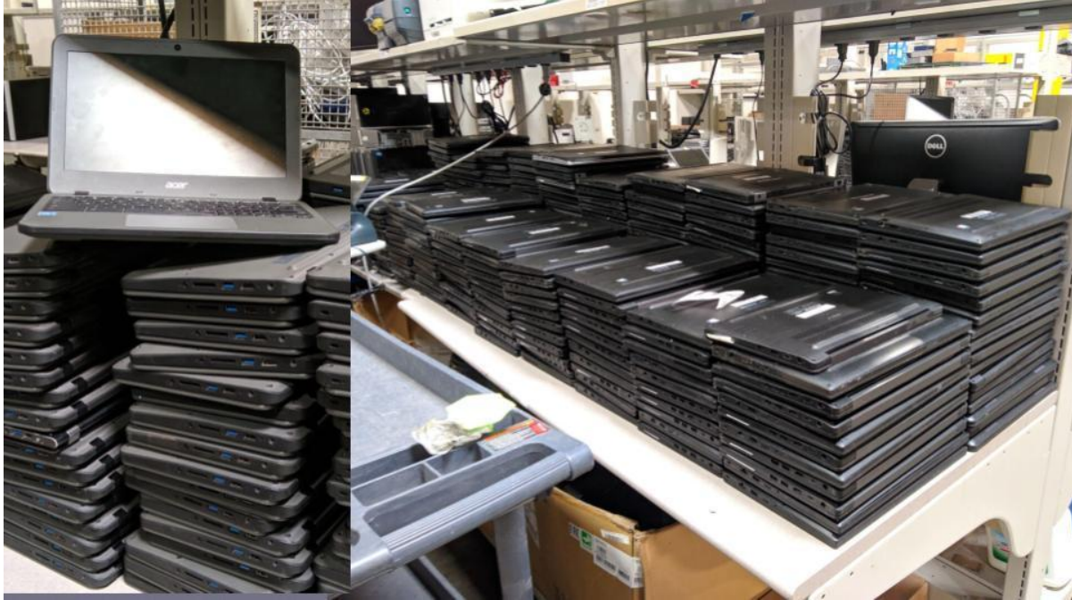
Figure 1. A school system's Chromebooks that are no longer usable.