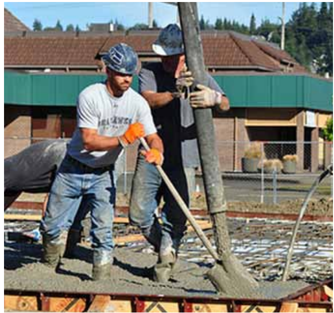
▲ The recent American Recovery and Reinvestment Act, funding projects such as this future transit center in Aberdeen, Washington, has accelerated transit expansion.

By taking these approaches, we can create a future where every American can get to work and school via public transportation—subways, rail, buses, walking, and biking. People are voting with their feet and moving to public transportation in increasing numbers—it is imperative that policy and investments accentuate and accelerate this trend in order to achieve energy independence and solve global warming.