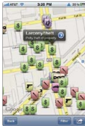
Figure 1. CrimeDeskSF iPhone App

Many other local governments have also joined the Transparency 2.0 movement with innovative ideas. The City of San Francisco, for example, recently launched DataSF, a searchable Web site that provides data on a variety of demographic and public works issues, from government spending to geographical crime data. Through the free, open-source technology, users can even comment on and rank the datasets to improve government performance in the future. The Web site also provides numerous iPhone apps that integrate the data and provide residents with useful tools (See Figure 1). 7