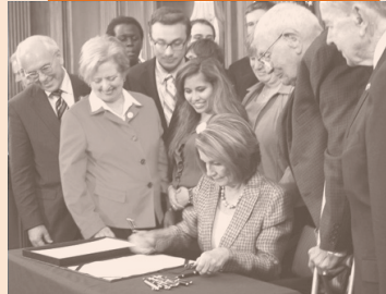
Speaker of the House Nancy Pelosi signs this year's health care legislation.