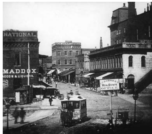
Streetcar traffic was a common sight on Peachtree Street during the first half of the 20th century, and well before: shown here is an early, horse-drawn Peachtree streetcar, circa 1882. Still a major thoroughfare today, Peachtree would once again benefit from electric streetcar services.

To encourage and accommodate the future growth and vitality of the Peachtree Corridor, business and community leaders have called for the restoration of streetcar service along Peachtree Street – this time provided by clean, modern streetcars of the type that have recently proven to be popular in cities such as Portland, Oregon,