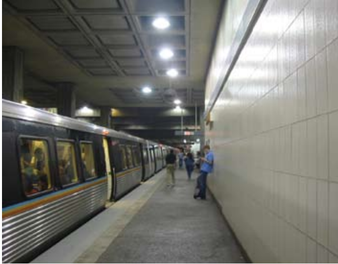
MARTA's Peachtree station. Expanding subway service to meet the I-285 perimeter would make the MARTA West line more useful and help reduce time and money lost to congestion.

several west-Atlanta transit schemes. 71 The MARTA Board voted for this combined subway and bus expansion in 2004, and the Transportation Planning Board incorporated the plan in the Concept 3 vision it had developed by August 2008. 72