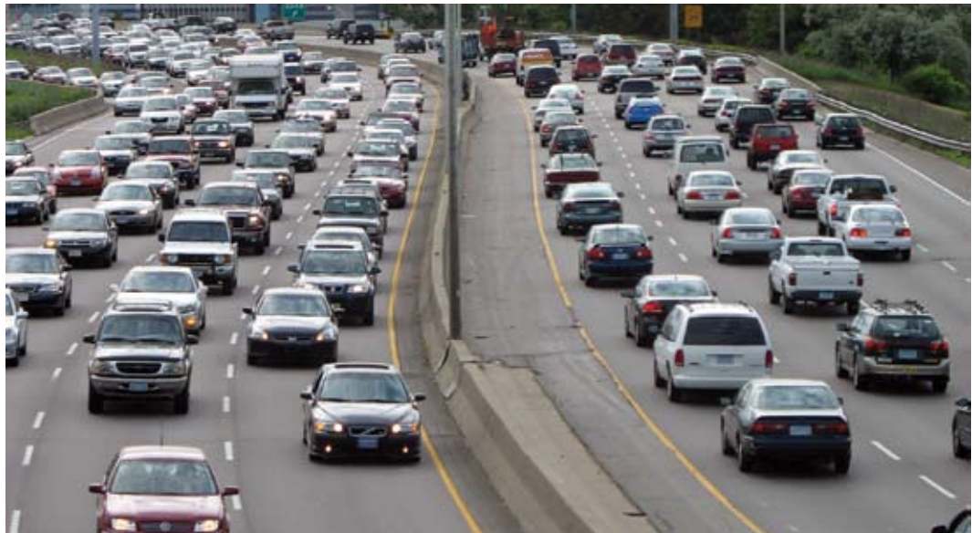
Heavy traffic wastes Georgians’ time and money, pollutes our air, and increases our oil dependence.

alternatives to driving – in fact, investment in transit and levels of service have actually declined in many parts of the state. But while Georgia’s transit systems struggle to provide even basic levels of service, bus and rail service continues to provide significant economic and environmental benefits to the state.