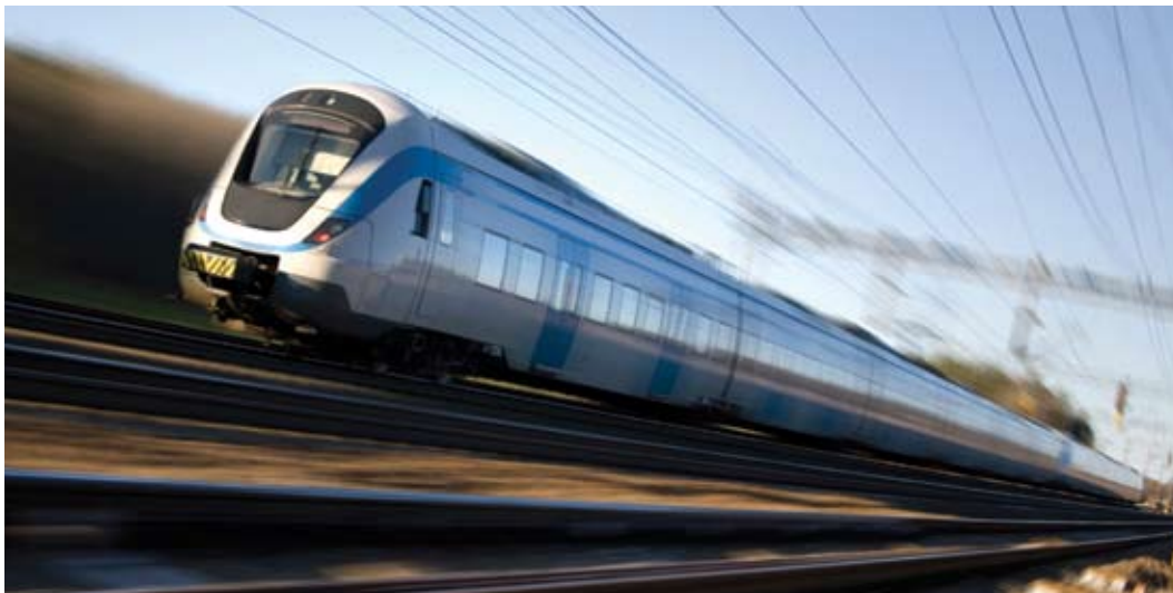
Electric high-speed rail moves passengers efficiently over long distances, saving time and cutting pollution. Three of ten federally-designated high-speed rail corridors pass through Georgia.

High-speed rail, however, has been neglected in the United States for years, despite its many advantages. For inter-city trips of less than 500 miles, high-speed trains can be nearly as fast – and in some cases even faster – than car or plane trips, especially when the time spent getting to and from airports and through airport security is factored in. Moreover, because high-speed trains run on electricity, they