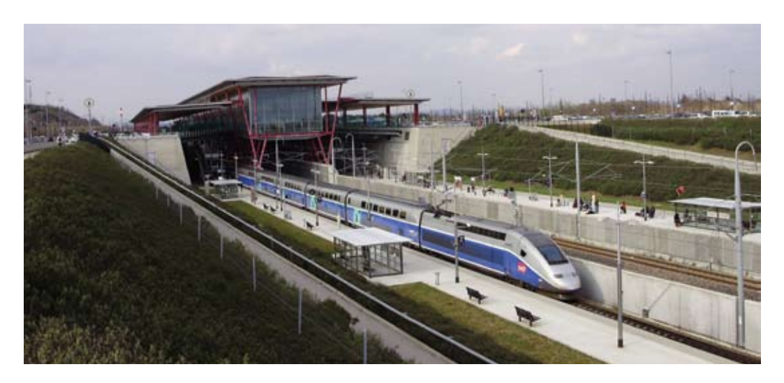
High-speed rail lines are complex systems, involving the construction of civil engineering works, the laying of tracks, the operation of trains and stations, and the development of effective signaling, communications and safety systems.

Finance: High-speed rail lines are typically multi-billion dollar projects that require the assembly of capital from a variety of sources, including various government entities, publiclyowned firms, and private investors.