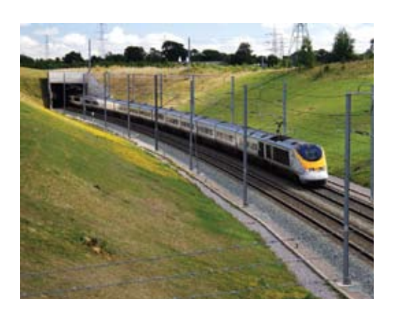
The concessionaire for construction of England's High Speed 1 line was forced to charge abovemarket access fees to recoup its investment. The British government later took over the company, a move intended to expand the use of the line.

The public faces dangers that a PPP may create a publicly subsidized piece of infrastructure that is primarily used to serve the profit-maximizing purposes of a private entity in ways that conflict with the public interest. The most obvious example of this tension arises in the setting of ticket prices. A private concession operator will tend to want higher-priced tickets as a way to maximize their revenue for shareholders, even if higher ticket prices depress total ridership and therefore diminish the positive public impact of the route.