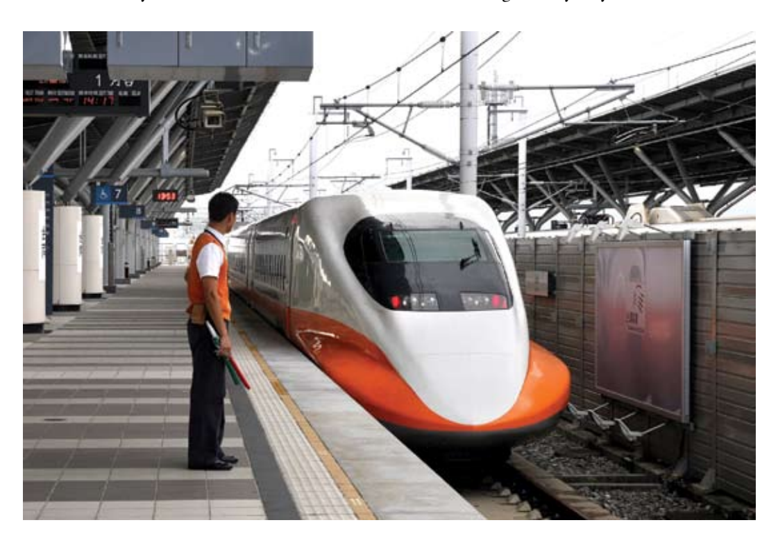
The private-sector builder of Taiwan's high-speed rail line initially pledged to build the system with no public investment. An accumulation of high-cost debt, however, ultimately led to a government bailout.

In order to keep the system operating, the government refinanced THSRC's loans and contributed hundreds of millions of dollars to the network, even though the original build-operate-transfer plan stipulated that the THSRC build the system without any government capital. The government has opted not to take over the company, expressing no interest in growing its current 40 percent share or investing money beyond the bailout.<sup>43</sup>