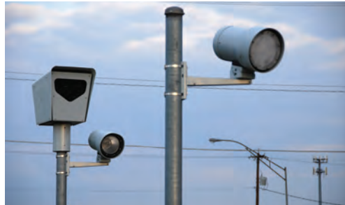
Privatized traffic enforcement system contracts that limit government discretion to set and enforce traffic regulations put the public at risk.

Solutions in exchange for early camera removal.