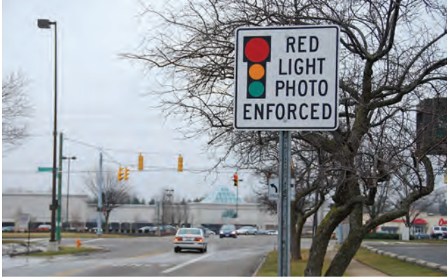
Many communities require signs to be posted before camera-equipped intersections, helping to deter violations of traffic laws.

to moving violations and then refer them to a collection agency to prevent citizens from ignoring tickets. 20