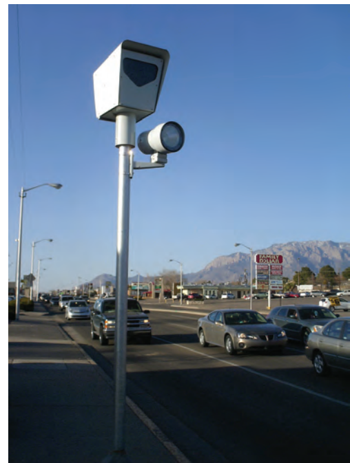
This camera system identifies violations of red-light signals at an intersection, transmitting evidence and vehicle identification information to the vendor. Vendors issue tickets, after approval by local authorities, which are then delivered to the registered owner of the vehicle.

State or local governments must specifically authorize enforcement agencies to cite violators by mail before automated enforcement systems can be used, making the registered vehicle owner responsible for the ticket. Law or judicial precedent must