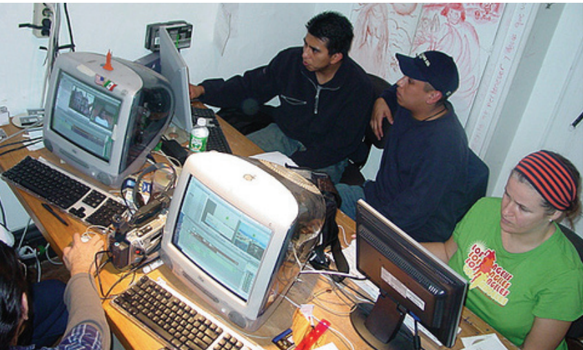
Public Access centers such as Manhattan Neighborhood Network have long served as resources for technology training, and can play a vital role in bridging the digital divide.

21stCenturyBroadbandSuperhighway.pdf). Building the information superhighway alongside the automobile highway would be an extremely wise use of public assets to further federal broadband policy.