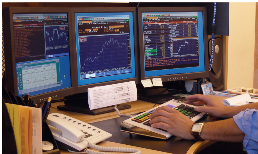
The federal government needs better data about broadband, such as the availability and use of publicly owned spectrum, and should make that information available to the public.