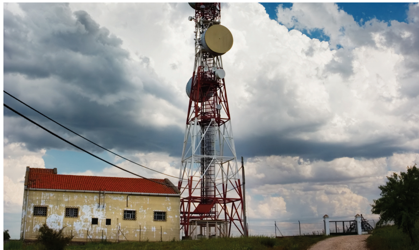
In many rural areas, locally owned communications networks have been vital for rapid-response needs, such as during natural disasters.