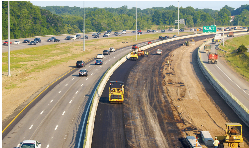
Deploying fiber optic cables as part of road or bridge construction would greatly expand middle mile broadband capacity.

In rural areas, there are federal mounting assets, such as telecom and fire towers that could speed the deployment of rural broadband using wireless technologies. Currently, mounting wireless antennas and transmitters on these assets is a long and