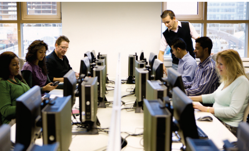
Programs that give new broadband users access to the tools, skills and technology will lead to the creation of online content that will make the Internet even more vibrant.

Given the Internet's increasingly central position in our culture, economy and democracy, policymakers must respond to a history of inequality in communications network deployment, economic opportu-