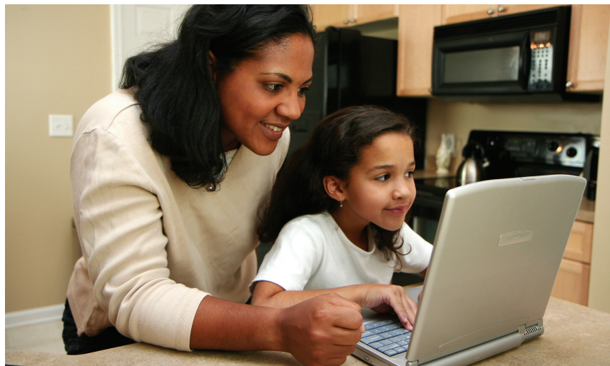
All U.S. consumers must have access to high quality, affordable broadband in order to fully participate in today's economy, civic and cultural society.

By adopting these principles, embodied in the detailed policy recommendations in this report, the National Broadband Plan will achieve these national goals and deliver to all Americans the opportunity they seek for their children and themselves: to reach for the American Dream in the Digital Age.