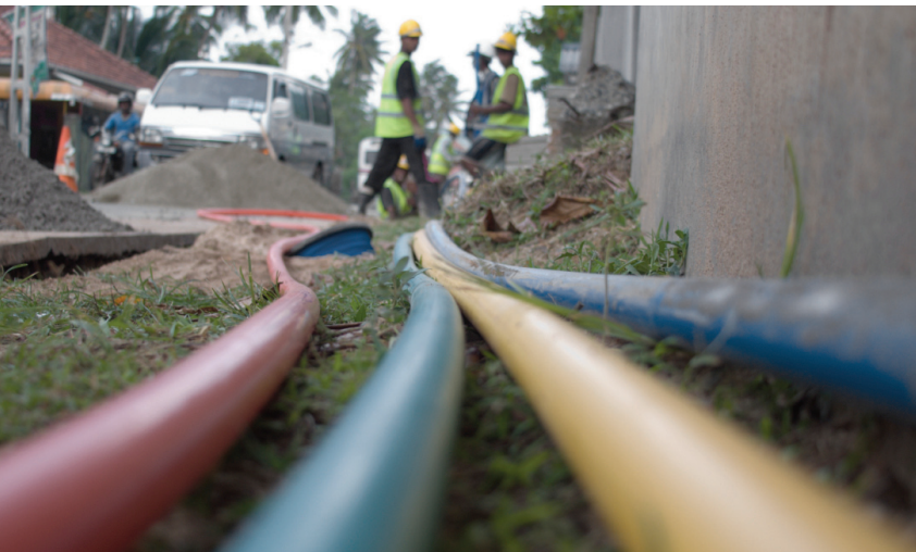
Many states and local governments have laid fiber optic broadband cables on public property, and these resources can be used better to benefit the public.

Another example: Many states have spent hundreds of millions of dollars on massive fiber optic loops or networks, such as the Iowa Communications Network and the Illinois Century Network, but restrict their use to government and educational institutions. Therefore, the public in surrounding communities is not receiving the maximum benefit possible from its investment in these loops and networks. These networks should also be opened to interconnection for the benefit of nonprofits and public interest community-based organizations.