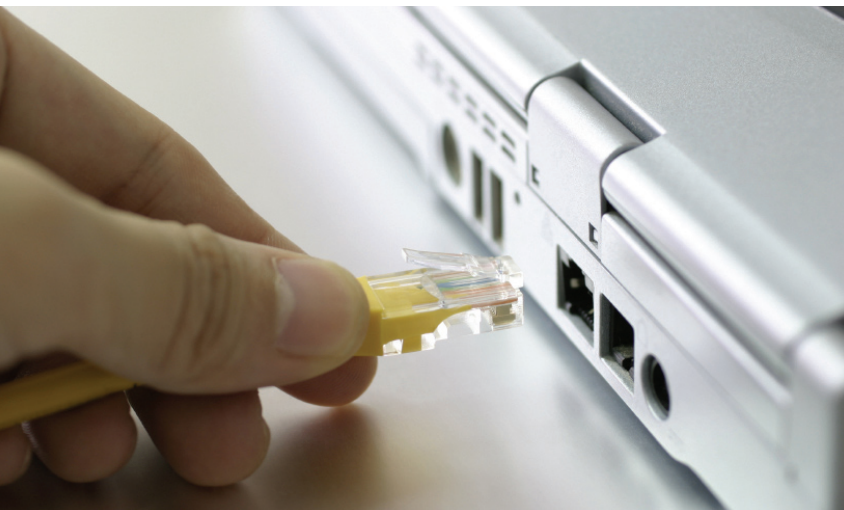
The Universal Service Fund must be modernized so that low-income consumers can receive Internet access and hardware.”

The Universal Service Fund (USF), which has been used to guarantee every consumer has access to a telephone line, should be used to expand wireline and wireless broadband infrastructure, so that advanced services that deliver multiple communications options such as telephony, data, and video over the same wires will become universally available. This does not mean we should eliminate Lifeline and Link Up for Plain Old Telephone Service (POTS) in the near term, or that funding for POTS should be eliminated where no entity can or will deploy high-speed