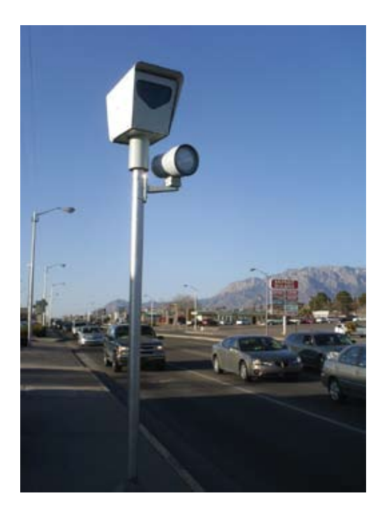
This camera system identifies violations of red-light signals at an intersection, transmitting evidence and vehicle identification information to the vendor. Vendors issue tickets, after approval by local authorities, which are then delivered to the registered owner of the vehicle.

State or local governments must specifically authorize enforcement agencies to cite violators by mail before automated enforcement systems can be used, making the registered vehicle owner responsible for the ticket. Law or judicial precedent must