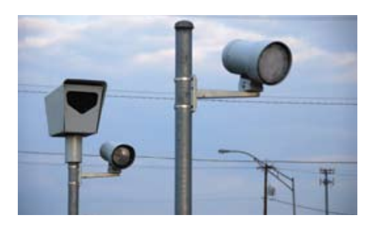
Privatized traffic enforcement system contracts that limit government discretion to set and enforce traffic regulations put the public at risk.

Solutions in exchange for early camera removal.