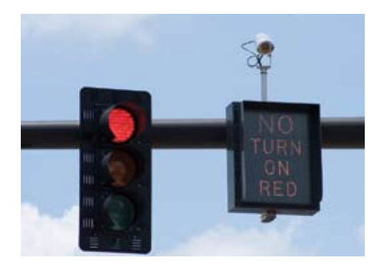
When camera vendors are even partially compensated based on the number of citations issued, the companies have a financial interest in stricter enforcement of red-light turn violations.

Tallahassee, Florida, signed a contract that assigns Affiliated Computer Services to "Develop the Program Infraction criteria and Enforcement Documentation (collectively the "Business Rules"), sample Notice of Violation and other relevant