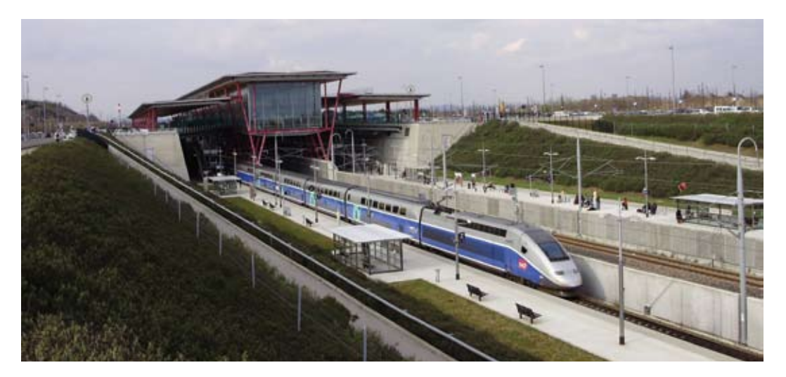
High-speed rail lines are complex systems, involving the construction of civil engineering works, the laying of tracks, the operation of trains and stations, and the development of effective signaling, communications and safety systems.

• Finance: High-speed rail lines are typically multi-billion dollar projects that require the assembly of capital from a variety of sources, including various government entities, publiclyowned firms, and private investors.