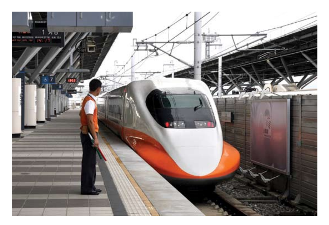
The private-sector builder of Taiwan's high-speed rail line initially pledged to build the system with no public investment. An accumulation of high-cost debt, however, ultimately led to a government bailout.

In order to keep the system operating, the government refinanced THSRC's loans and contributed hundreds of millions of dollars to the network, even though the original build-operate-transfer plan stipulated that the THSRC build the system without any government capital. The government has opted not to take over the company, expressing no interest in growing its current 40 percent share or investing money beyond the bailout.<sup>43</sup>