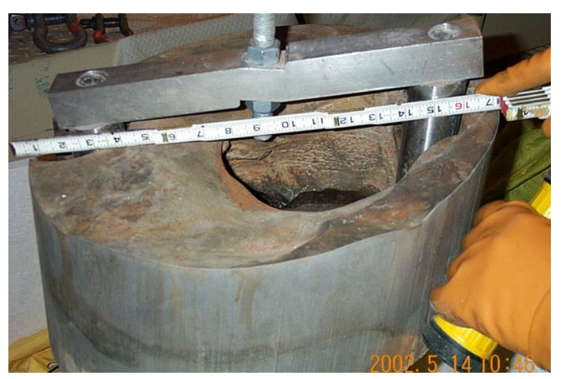
In 2002, corrosion of the vessel head at the Davis-Besse nuclear power plant in Ohio could have led to the loss of coolant from the reactor core and a meltdown. The incident is considered to be the most serious in the United States since Three Mile Island.

Nuclear plants contain thousands of critical parts. Inevitably, some of those parts fail and need to