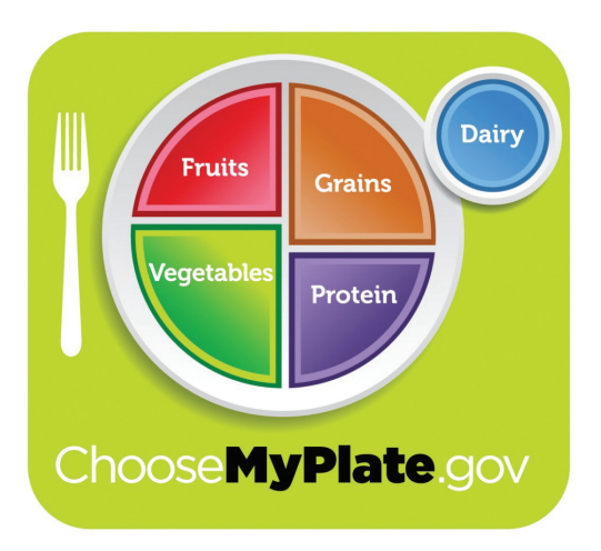
Figure 1. USDA Food Plate

USDA's recommendations for a healthy diet include a substantial role for fresh fruits and vegetables, but none for junk food.