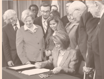
Speaker of the House Nancy Pelosi signs this year's health care legislation.