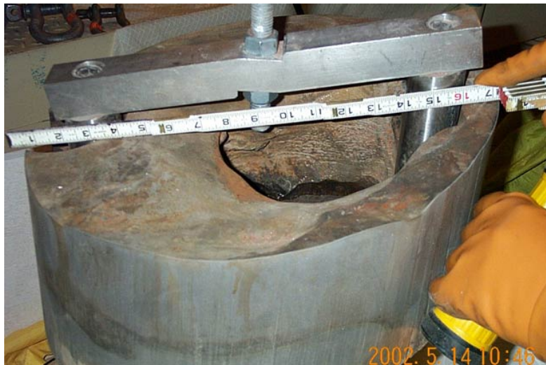
In 2002, corrosion of the vessel head at the Davis-Besse nuclear power plant in Ohio could have led to the loss of coolant from the reactor core and a meltdown. The incident is considered to be the most serious in the United States since Three Mile Island.

Nuclear plants contain thousands of critical parts. Inevitably, some of those parts fail and need to