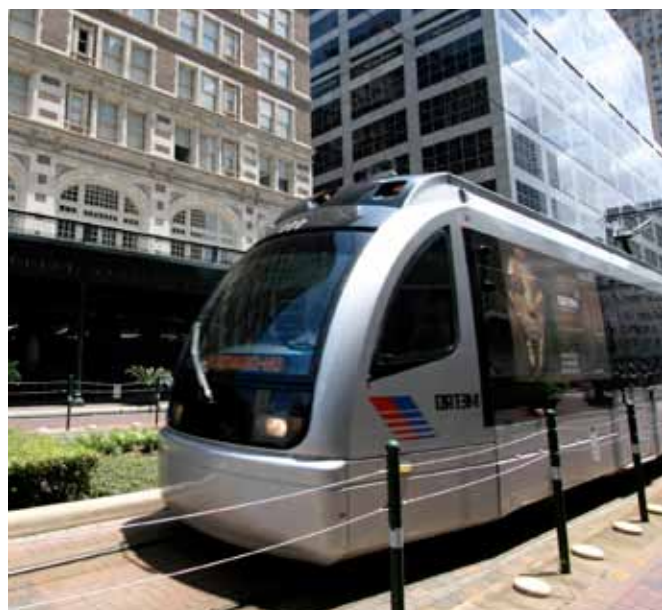
▲ In 2008, light rail had the highest percentage of annual ridership growth among all transit modes—an 8.3 percent increase.