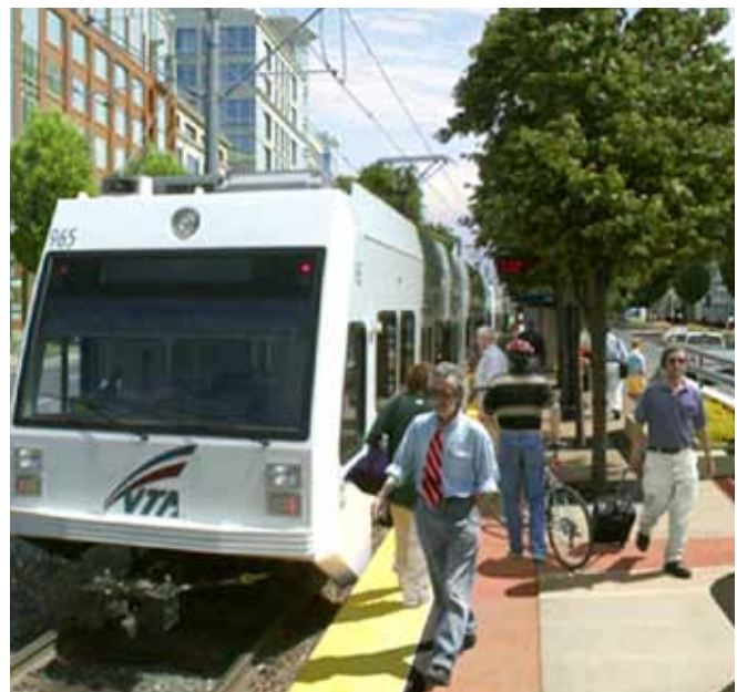
▲ Four in five Americans believe increased investment in public transportation strengthens the economy, saves energy, creates jobs, helps reduce traffic congestion and decreases air pollution.

Existing systems would undergo significant expansion, allowing the largest urban systems to expand heavy rail and grow light rail and bus rapid transit systems linking urban centers and suburban areas. Commuter rail and new high-speed rail