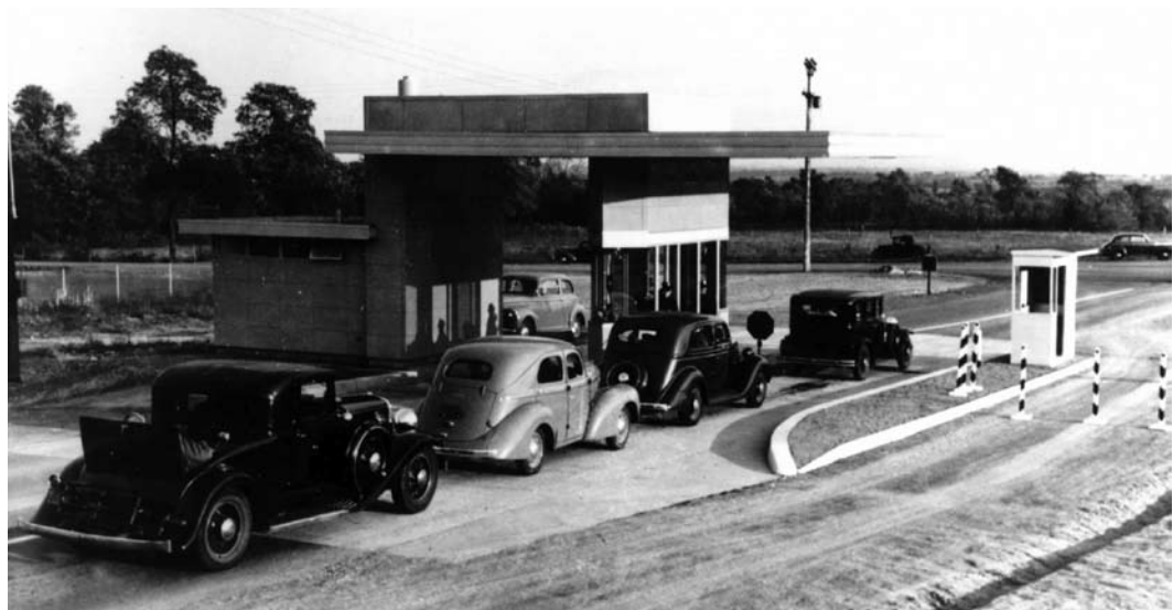
Cars lining up for the opening of the Pennsylvania Turnpike in 1940.

Beyond the uncertainties inherent in a multi-generational time frame, an additional issue of good-government arises: disenfranchisement of future generations of voters. Private investors specifically seek out essential thoroughfares which lack attractive alternative routes. These highways are vital infrastructure, integral to the daily lives of residents. So long as the State, directly or through a Turnpike Authority, retains control over its toll roads, voters have the ability to hold decision-makers accountable. Turning over control of the