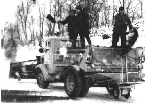
Winter road maintenance in the early days of the Pennsylvania Turnpike.

roads to private investors eliminates that accountability and binds future voters to present-day decisions. Doing so for several generations of voters is simply anti-democratic.