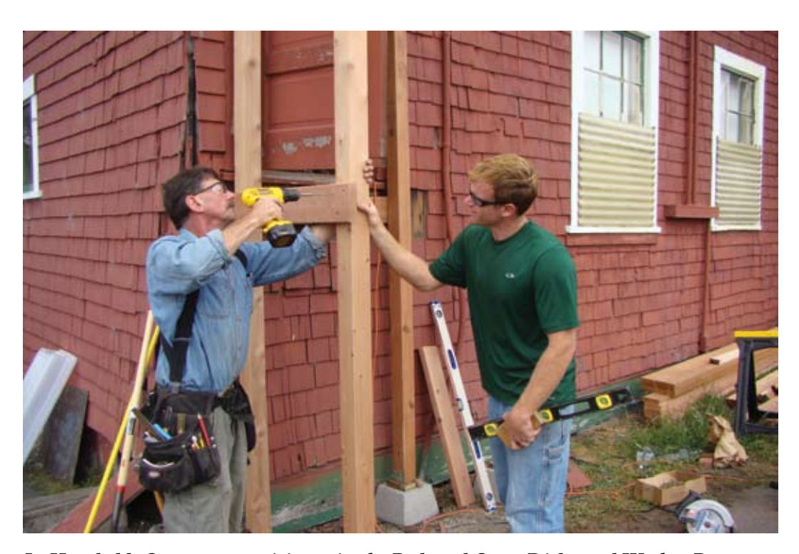
In Humboldt County, a participant in the Redwood Coast Dislocated Worker Program, left, works with a young worker, right, from the county's Youth Green Building Pre-Apprentice-ship Program. They are retrofitting an old cookhouse that will eventually be a green hostel.

This pattern is being replicated all over California, as thousands of people undergo training each year for clean energy jobs. Non-profits, community colleges, unions, and private companies are recruiting workers statewide to participate in training programs that will give them skills needed in California's new economy. These skilled professionals will be essential to developing the clean energy economy that California has so ardently encouraged through its energy and environmental policies.