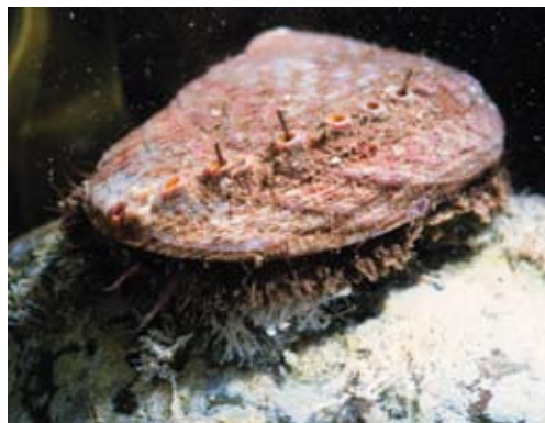
Flat abalone.

Oregon is also the only place in the United States and Canada where flat abalone can be commercially harvested. 77 In 1993, Oregon created the developmental fishery program, which was designed to both encourage and regulate the development of new fisheries in the state. In 2001, a commercial diver received a permit to