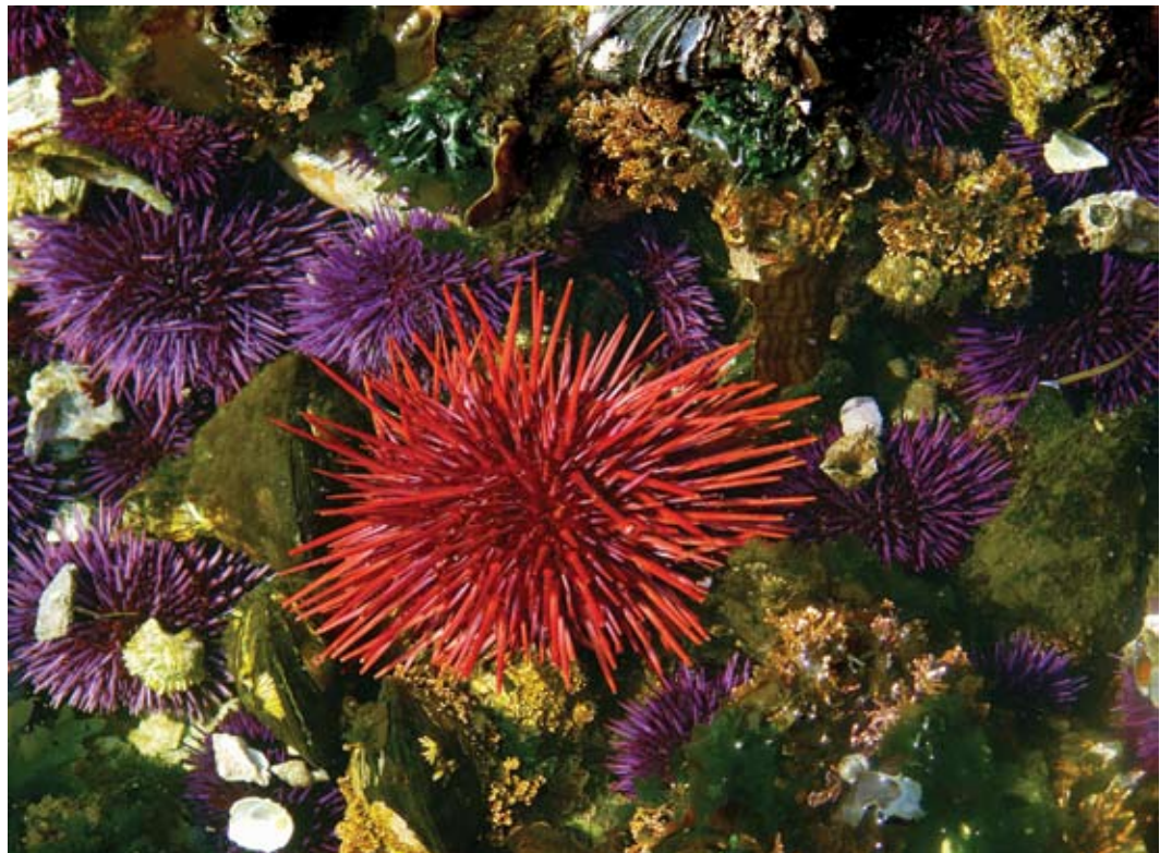
Red urchin.

Tufted puffins also depend on ample supplies of forage fish near their colonies in order to sustain their chicks. In California, a decline in the abundance of forage fish is thought to be one cause of declining tufted puffin populations in the Farallon Islands. 94 Therefore, efforts to protect and regener-