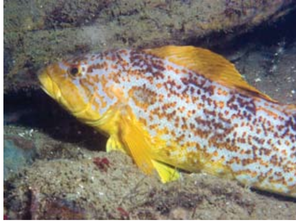
Kelp greenling .

Rockfish, a type of groundfish, are vital to Oregon's recreational fishery. The quantity of blue and black rockfish