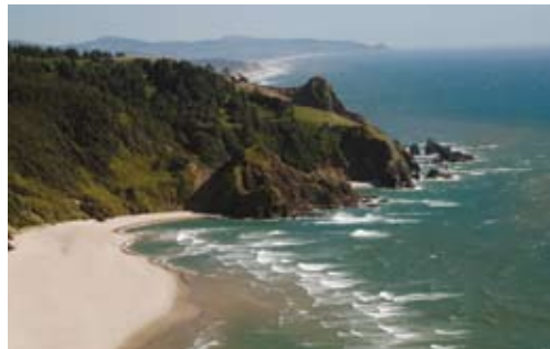
View from Cascade Head.

Underneath the waves, the same rocky features that provide world-renowned surfing also shelter a wide variety of fish,