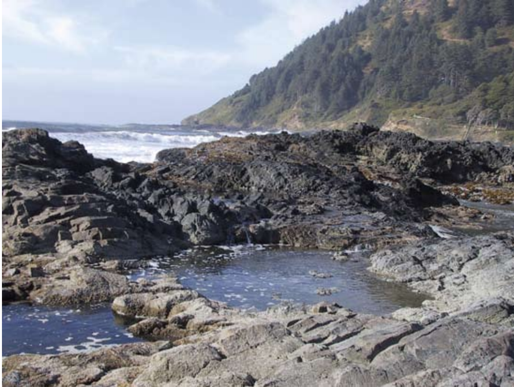
Tidepools at Cape Perpetua.

age. 58 There is still much that scientists do not know about the path to recovery of Oregon's depleted fish stocks. Only a small portion of the Oregon coast has been mapped for the habitat it provides to fish, and only a small number of fish species have been fully assessed for the health of their species.