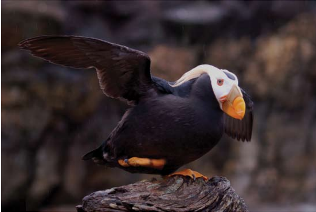
Tufted puffin.

the west of the rocks provides valuable and rare habitat for many fish species.