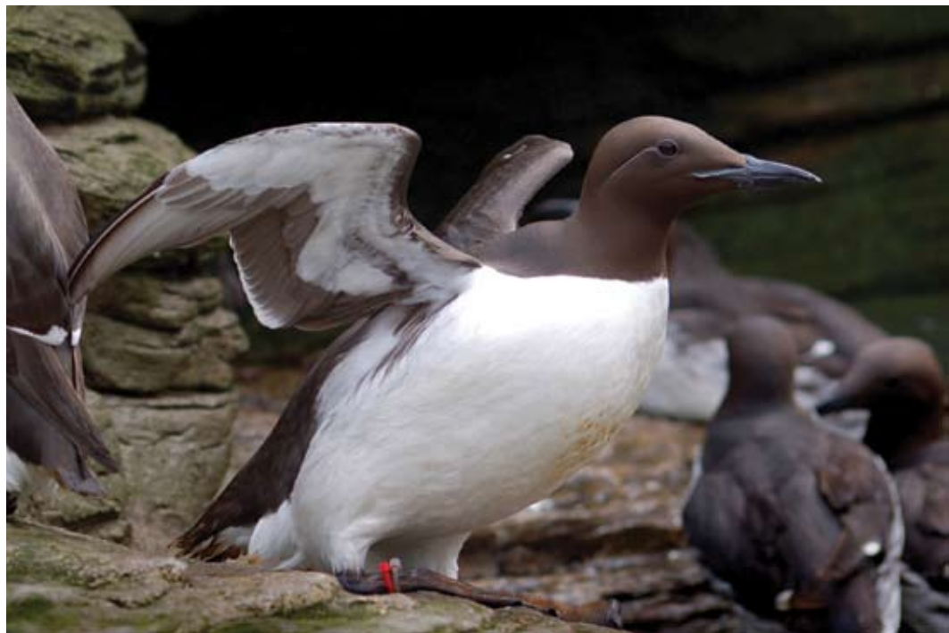
Common murre.

The area between Cape Falcon and Tillamook Head near the communities of Cannon Beach and Seaside is one of Oregon's great scenic treasures. The rigorous climb up Tillamook Head (which explorer William Clark called "the Steepest worst and highest mountain I ever assended") rewards visitors with breathtaking views of the Pacific Ocean and of the decommissioned Tillamook Rock lighthouse perched on a rocky outcropping a mile offshore. 37