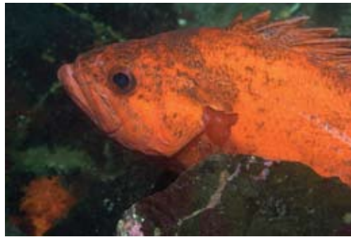
Vermillion rockfish.

Rockfish species found in this area include the China, copper and quillback rockfish, which are important in both sport and commercial fisheries. 16 They prefer rocky habitat, and quillback and copper rockfish have a strong preference for reefs