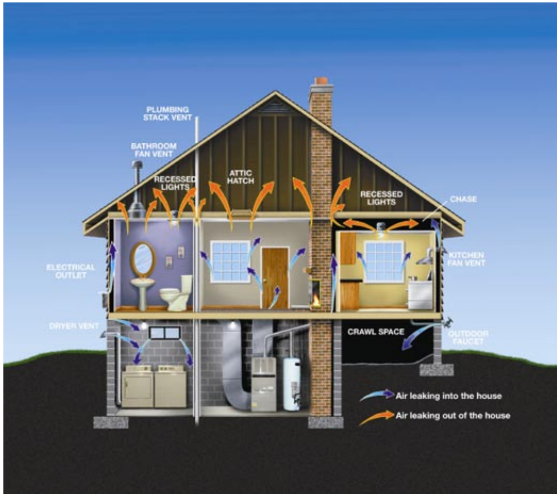
Figure 1. Sealing air leaks and installing insulation can combat energy waste that costs us money. 6

Compact fluorescent light (CFLs) bulbs use about 75 percent less energy than incandescent bulbs and last 10 times longer. 9 Yet, in 2007, CFLs accounted for only about 10 percent of light bulb sales. 10 The American Council for an Energy-Efficient Economy estimates that