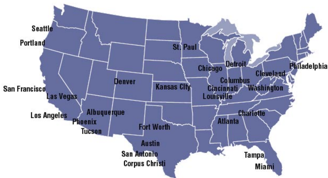
Figure 3. Cities across the country are planning to build or expand commuter rail or light rail systems to meet increased demand for transportation options. The cities pictured above are just some of those hoping to expand transit systems – greater federal investment would help. 59

There are other ways to reduce driving as well. For nearly two decades, Washington state has had an effective law designed to reduce the number of single-passenger commuters traveling to and from worksites.