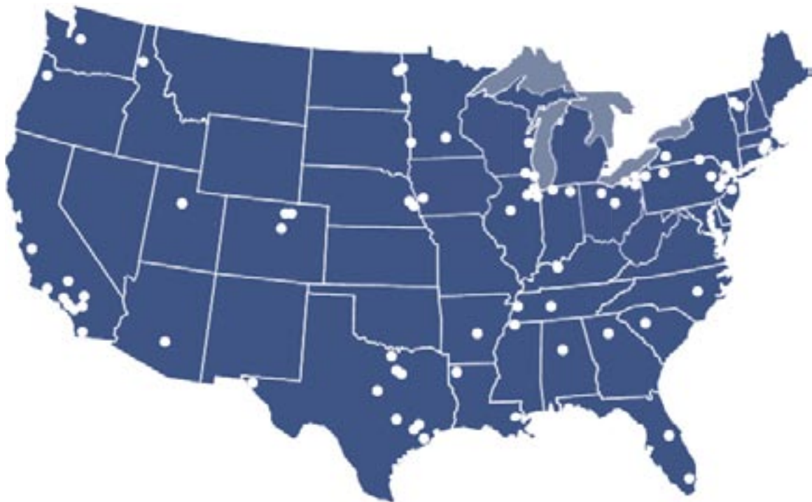
Figure 4. Companies all across the country were engaged in making parts for wind turbines in 2004. 77 With the recent boom in wind energy, the number of such companies is certainly greater today.

Just as the vast wind energy resources on the Great Plains or the solar energy resources in America's South-