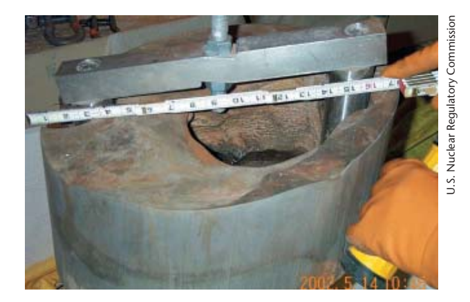
Nuclear power regulators failed to prevent the corrosion of the reactor vessel head at Ohio's Davis-Besse nuclear power plant.

In 2002, the most significant nuclear incident in the U.S. since Three Mile Island took place at the Davis-Besse nuclear plant in Ohio. Workers discovered a footballsized cavity in the reactor's vessel head. Left undetected, the problem could eventually have led to leakage of radioactive coolant from around the reactor core and, possibly, a meltdown. The U.S. Government Accountability Office (GAO) concluded that the NRC "should have but did not identify or prevent the vessel head corrosion at Davis-Besse" and that the NRC's "process for assessing safety at nuclear power plants is not adequate for detecting