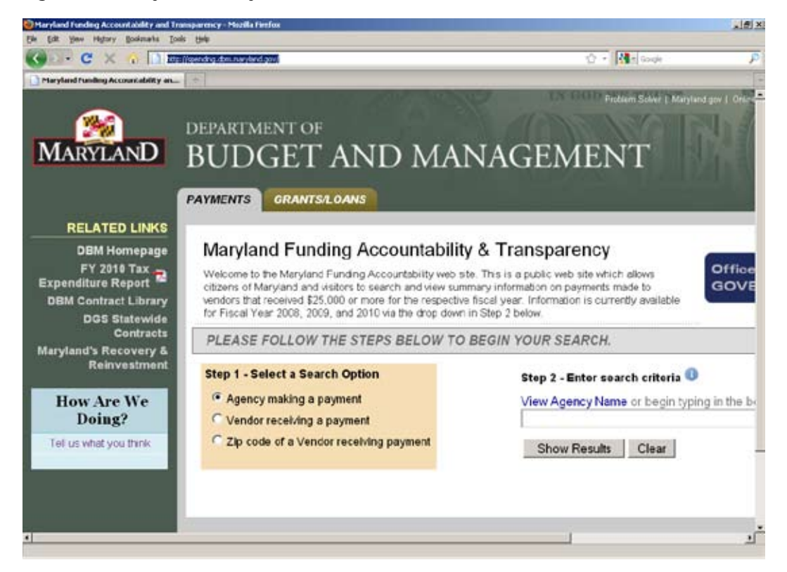
Figure 8A: Maryland's "Payments" Portal

• State loans: Some states provide users with information on loans the state has