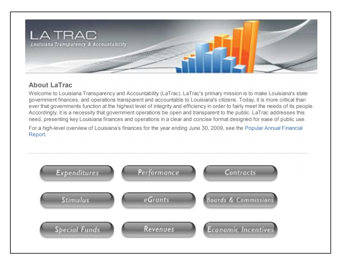
Figure 4: Louisiana's Easy-To-Navigate Template