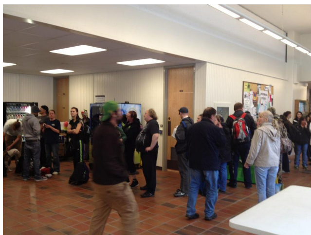
Line at one of the two Higher One ATMs at a college as spring quarter classes start, April 2012. Line continues in both directions where picture ends, totaling around 50 students. Both ATMs ran out of money by lunchtime.

The Department of Education has established rules that prohibit fees to access student aid money disbursed to a debit card on ATMs as long as the issuing bank provides conveniently located fee-free ATMs. 21 However, the rules specifically allow the bank to charge foreign ATM fees when students use other machines. The current rules do little to define what “conveniently” located means in terms of location or number of ATMs, as well as cash availability in the ATMs when disbursements arrive. The rules do not protect students from situations in which they are charged money to access their aid funds. The rules do not protect students from changing terms and conditions that impact fee structures and can affect their ability to access their aid freely and conveniently.