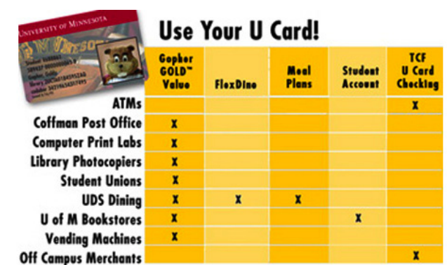
Marketing TCF’s U Card at the University of Minnesota

As one example, TCF Bank has alliances with the University of Minnesota, the University of Michigan, the University of Illinois and two other colleges. These alliances include exclusive marketing, naming rights and other agreements. Branches have been opened on many of these college campuses. TCF provides multi-purpose campus cards for many of these colleges. Its cards serve as a school identification card, ATM/debit card, library card, security card, health care card, phone card and stored value card for vending machines or similar uses. TCF is ranked 5th largest in number of campus card banking relationships in the U.S. On December 31, 2011, the bank held $274.3 million in campus deposits. TCF has a 25-year naming rights agreement with the University of Minnesota to sponsor its on-campus football stadium, “TCF Bank Stadium,” which opened in 2009. 10