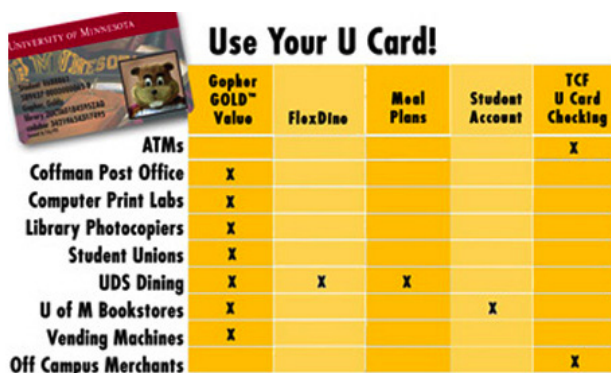
Marketing TCF’s U Card at the University of Minnesota

According to a leading industry survey conducted for the 2011 academic year, 151 schools had campus debit card/student ID programs with seven 12 leading banks. Higher One, a large non-bank financial firm, reported in its Securities and Exchange Commission (SEC) filing through March 31, 2012 that 520 campuses servicing more than 4.3 million students used its disbursement service; over 2.1 million of those students used its OneAccount debit account. 13