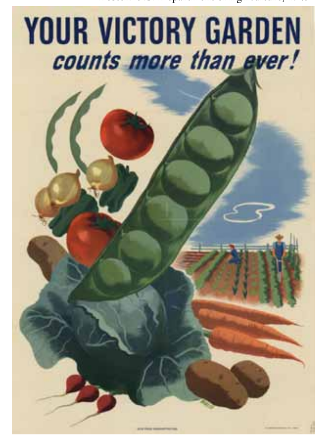
During World War II, citizens viewed growing their own food as a patriotic act. Now, after decades of grassroots activity, public consciousness of the importance of a sustainable and local food supply is rapidly returning, creating opportunities to reduce the impact of food production on our environment.

The logical next step in building the sustainable agriculture movement is to shift the focus of government policy away from encouraging unsustainable methods