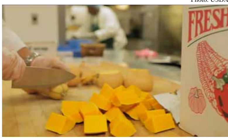
Philadelphia's Common Market, pictured here, is a wholesale distributor of local food to buyers including area hospitals, schools, and the city transit agency. State funding helped to launch the business.

To get local food distribution networks up to speed, governments can offer technical, financial or zoning support. Policy support can make it easier and cheaper for local businesses to obtain seasonal local