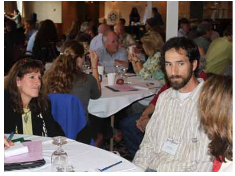
To facilitate collaboration in building a sustainable food system, Vermont established a "Farm to Plate Network," bringing together government, educational and community leaders. At the first meeting of the network, pictured here, members discussed how to reach Vermont's goal of doubling local food consumption by the end of the decade.