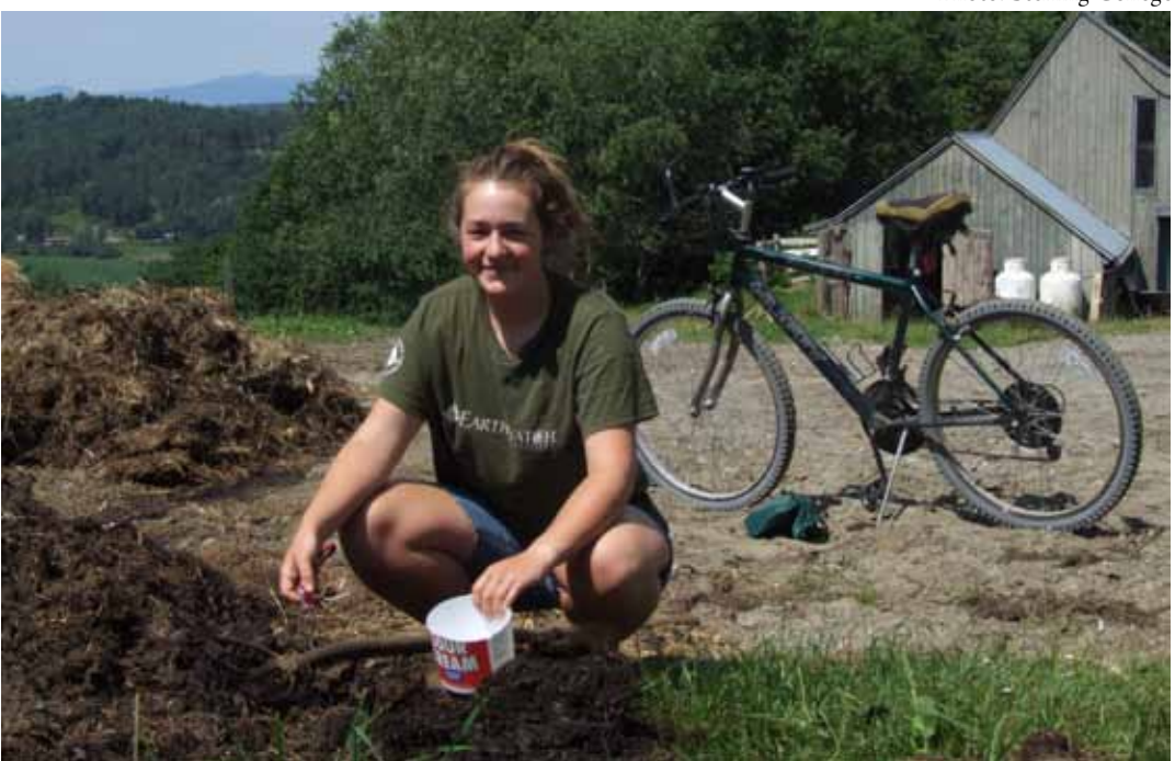
A sustainable food system can help reduce global warming pollution by increasing the ability of soil to capture and retain carbon dioxide (through techniques including the use of compost as fertilizer, as pictured here) and by reducing energy needs for food packaging, shipping and storage.

conventional food distribution system. In the United States, a typical food item travels more than 1,500 miles from the farm to the kitchen.<sup>22</sup> Some food items travel in particularly inefficient ways such as fresh fruit or vegetables from the Southern Hemisphere transported in refrigerated cargo planes. Food items transported by diesel trucks have lower - but still substantial - per-unit global warming impacts, while food transported by cargo ship can have very low per-unit impact.23