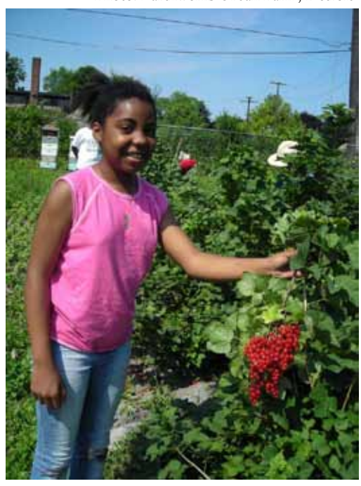
Detroit city policy explicitly supports urban agriculture, allowing residents to "adopt" vacant lots free of charge and use them to grow food. The city is home to hundreds of urban farms, some as large as four acres.