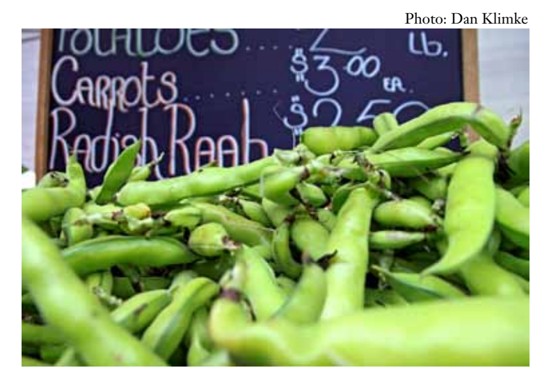
Farmers can grow and market fresh peas with 75 percent less energy than packaging peas in an aluminum can, helping to prevent global warming pollution.

Pennsylvania has been a pioneer in the development of policies to promote sustainable food economies, but can also learn from successful policy innovations in other states.