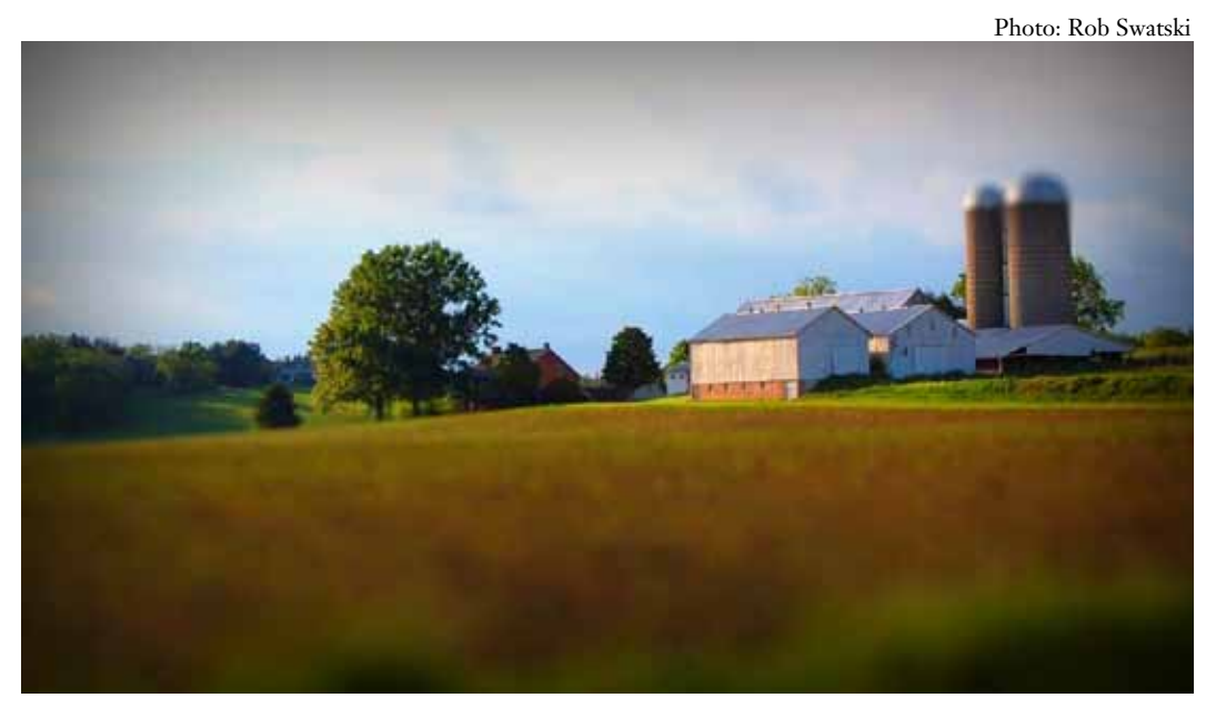
Farming at its best plays a critical role in preserving open space and the ecosystem services it provides.

As demand for local and organic food has grown, farmers have responded, with increasing numbers pursuing organic certification, entering community-supported agriculture arrangements, and supplying farmers markets.