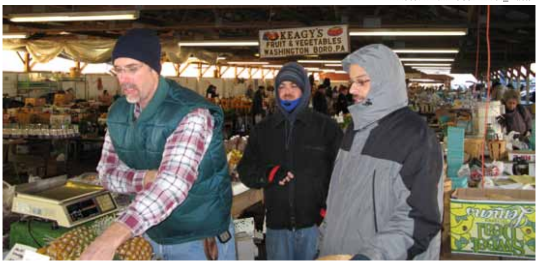
Farmers markets, such as this one in Leesport, are a primary retail outlet for many sustainable farmers. Increasing the number, convenience and visibility of farmers markets can draw both more farmers to sell sustainable produce, and more customers to buy it.

increasing farmers' ability to sell directly to local customers. The legislation authorized the state Department of Agriculture to award grants of up to $10,000 to farmers, non-profits, or businesses for the purpose of developing or expanding farmers markets anywhere in Pennsylvania. The law instructs the department to consider the potential of the market to increase the purchase of locally-grown produce, to revitalize a community, and to reach underserved areas when awarding grants. 146