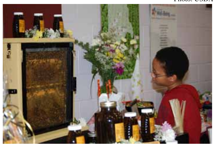
Elementary schools in Pawtucket, Rhode Island, serve meals made with many local ingredients, including honey from bees kept by Aquidneck Island Apiaries, which brought a sample hive to school in March 2011. Farm-to-school policies facilitate connections between schools and local farms, providing a vehicle to support sustainable food production techniques.

Woodbury County in Iowa has pioneered a policy that increases demand for organic food that comes