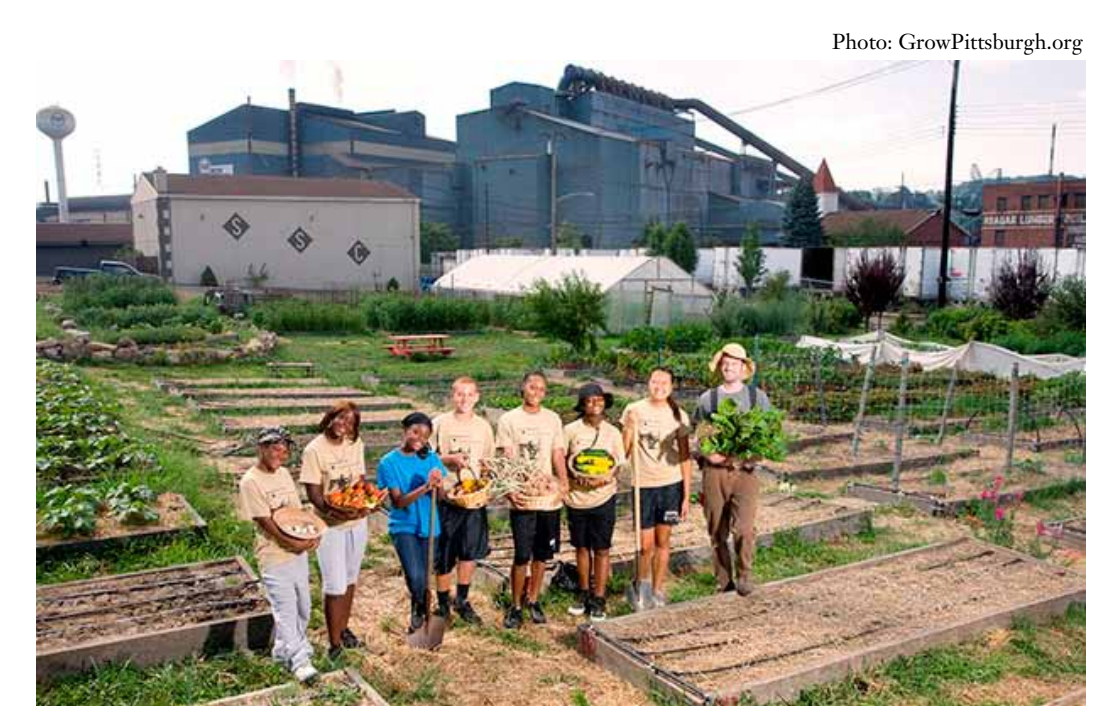
The non-profit Grow Pittsburgh transformed abandoned lots in the borough of Braddock into an urban organic farm in 2007.

former brownfield the size of a city block (Greensgrow), school gardens, a farm at the Schuylkill Center, and a farm managed by the Weavers Way Co-op grocery store.<sup>86</sup>