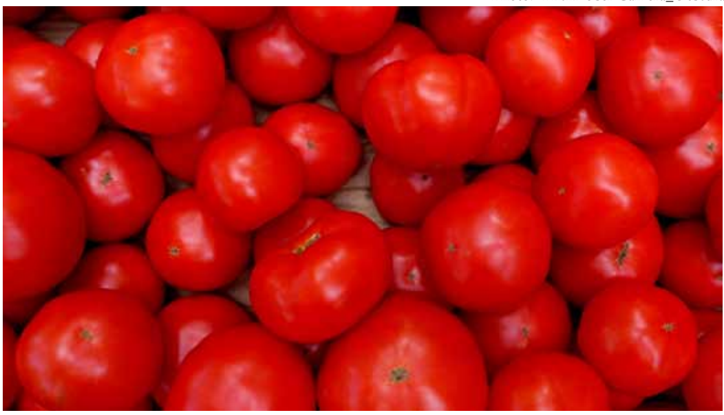
Pennsylvanians are increasingly hungry for fresh, locally grown food, like these tomatoes from the Clark Park Farmers Market in Philadelphia.

Nationally, the organic food market is likely to exceed $25 billion in 2011, and is expected to continue to grow into the future.30 Demand for organic food products climbed 20 percent or more annually through the 1990s and continued to grow at double-digit rates at least until the recession struck in 2008.31 (See Figure 1, page 18.)