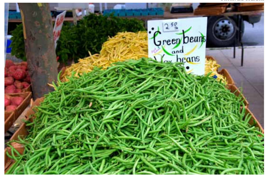
The sustainable agriculture movement offers an opportunity to protect Pennsylvania's environment, while simultaneously providing diverse, healthy, fresh food, keeping more dollars in local economies, strengthening local community bonds, revitalizing blighted areas, and creating jobs.

expanding the political constituency for better ways of producing and distributing our food.