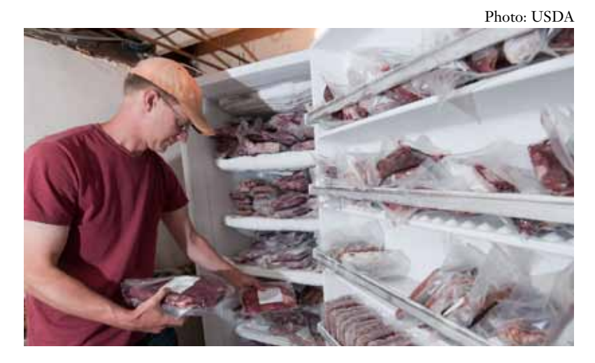
A food hub should provide covered space, loading docks, and cold storage capabilities. For example, the freezer pictured here at the Fall Line Farms Food Hub stores meat produced by Dragonfly Farm in Virginia, before delivery to consumers that order the meat through Lulu's Local Food website.