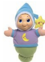
Hasbro's Gloworm: Testing Found Three Phthalates