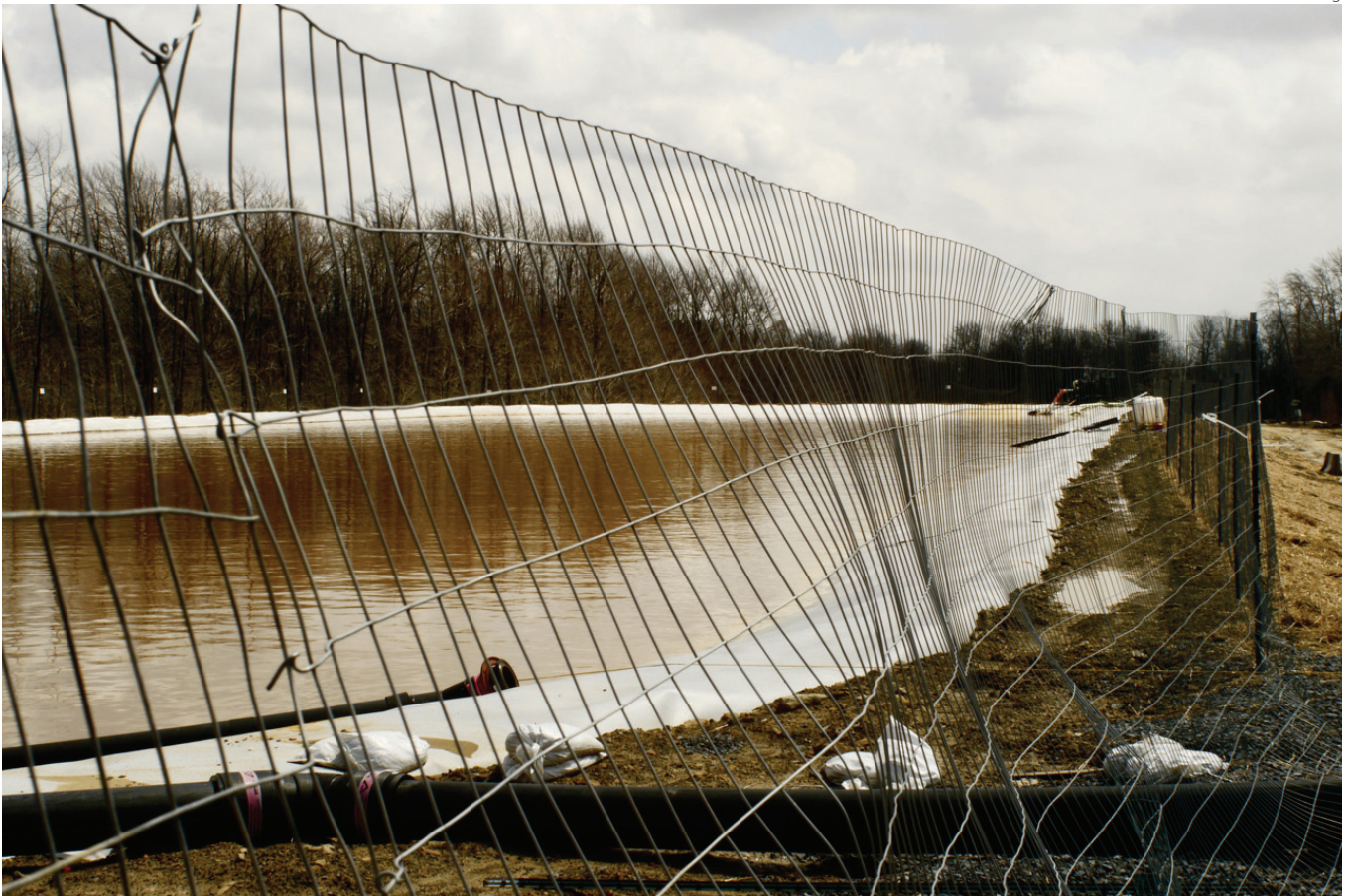
The storage and disposal of contaminated wastewater from fracking can lead to pollution of rivers, streams and groundwater. Pictured is a containment pond for wastewater at a Marcellus Shale natural gas drilling operation in Potter County, Pennsylvania.

depths commonly reached by fracking, despite documented instances in which fracking wells have cost $700,000 or more to plug. In addition, most states have “blanket bonding” options that further reduce the amount of financial assurance a driller must provide – in some cases to less than $100 per well.