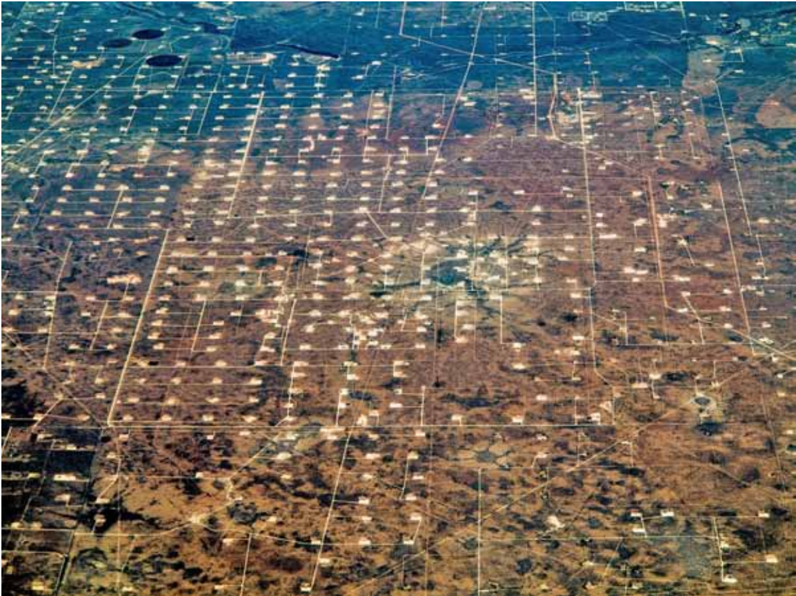
A grid of drilling sites and roads, similar to those used in fracking, lies across the landscape near Odessa, Texas.

In the years to come, fracking may affect a much bigger share of the landscape. According to a recent analysis by the Natural Resources Defense Council, 70 of the nation's largest oil and gas companies have leases to 141 million acres of land, bigger than the combined areas of California and Florida. 113 More-