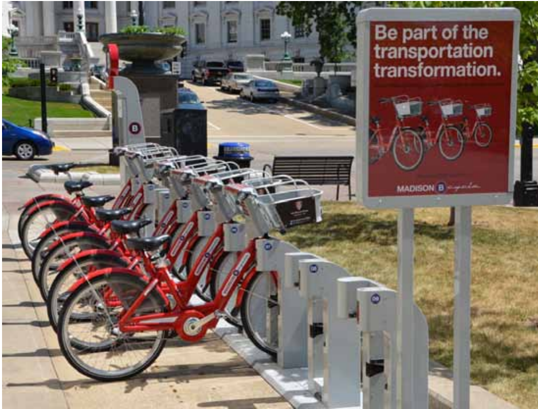
UW-Madison provides students with discounted membership in the city's bikeshare program, B-cycle.

enthusiasts, UW-Madison has made cycling a particularly popular option for students. In good weather, 22 percent of students travel to campus by bike, a figure that has risen in recent years, making biking to class the second most popular choice after walking. 56 After a decline in the late 1990s and early 2000s, the share of students biking to campus has climbed eight percentage points since 2006. 57 All told, about 12,000 people bike to campus each day in Madison and just 6.5 percent of students drive alone. 58