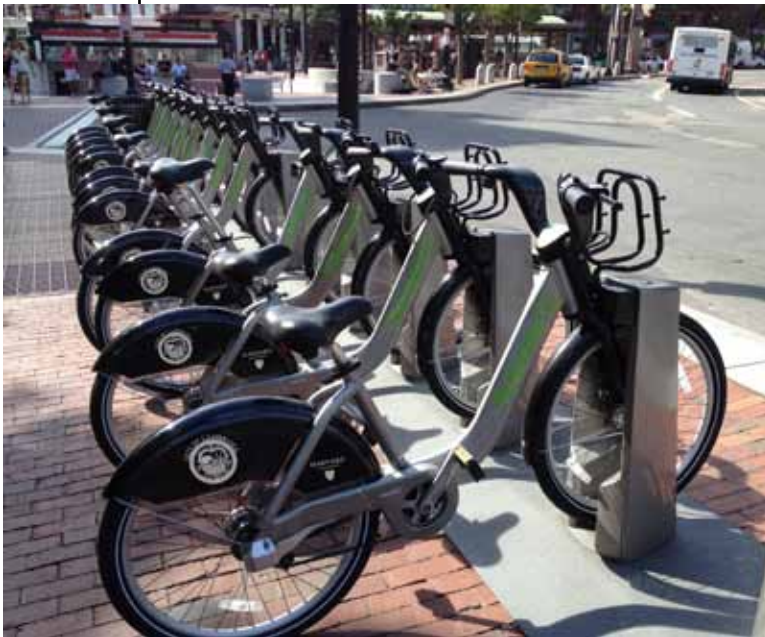
The Hubway bikeshare program is increasingly popular at Harvard University.

more members will join. The more members there are, the more our community will see bicycles and bikeshare as a viable and safe transportation option for traveling to and within our campus. That will in turn attract even more members and spur the building of more stations. We've seen it here at Harvard, and I hope to see it throughout the whole region." Other educational institutions in the area supporting Hubway include Northeastern University, the University of Massachusetts Boston, College of the Fenway and Massachusetts Institute of Technology. 61