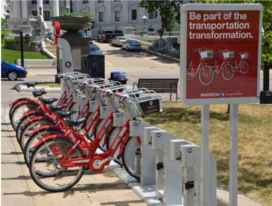
UW-Madison provides students with discounted membership in the city's bikeshare program, B-cycle.

enthusiasts, UW-Madison has made cycling a particularly popular option for students. In good weather, 22 percent of students travel to campus by bike, a figure that has risen in recent years, making biking to class the second most popular choice after walking. 56 After a decline in the late 1990s and early 2000s, the share of students biking to campus has climbed eight percentage points since 2006. 57 All told, about 12,000 people bike to campus each day in Madison and just 6.5 percent of students drive alone. 58