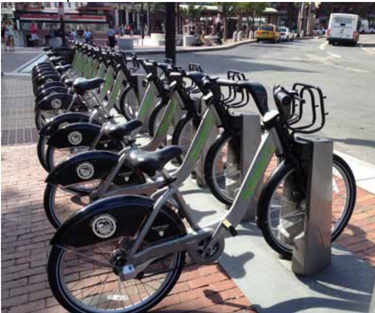
The Hubway bikeshare program is increasingly popular at Harvard University.

more members will join. The more members there are, the more our community will see bicycles and bikeshare as a viable and safe transportation option for traveling to and within our campus. That will in turn attract even more members and spur the building of more stations. We've seen it here at Harvard, and I hope to see it throughout the whole region." Other educational institutions in the area supporting Hubway include Northeastern University, the University of Massachusetts Boston, College of the Fenway and Massachusetts Institute of Technology. 61