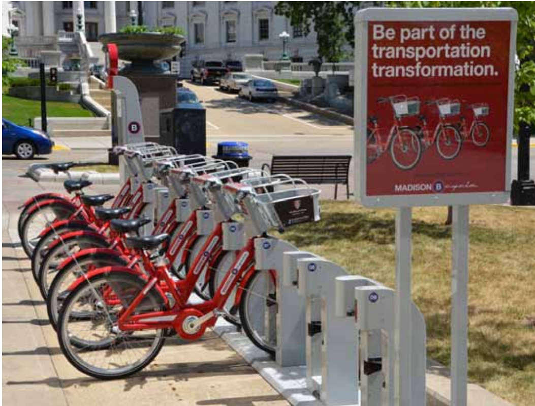
UW-Madison provides students with discounted membership in the city's bikeshare program, B-cycle.

enthusiasts, UW-Madison has made cycling a particularly popular option for students. In good weather, 22 percent of students travel to campus by bike, a figure that has risen in recent years, making biking to class the second most popular choice after walking. 56 After a decline in the late 1990s and early 2000s, the share of students biking to campus has climbed eight percentage points since 2006. 57 All told, about 12,000 people bike to campus each day in Madison and just 6.5 percent of students drive alone. 58