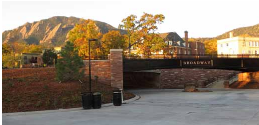
Pedestrian and bicycle underpass at Broadway bordering the CU-Boulder campus.