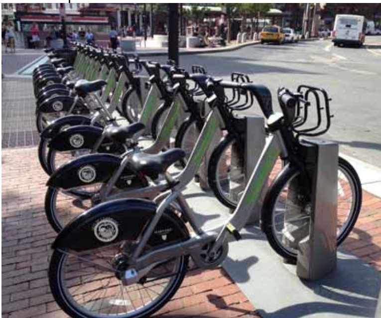
The Hubway bikeshare program is increasingly popular at Harvard University.

more members will join. The more members there are, the more our community will see bicycles and bikeshare as a viable and safe transportation option for traveling to and within our campus. That will in turn attract even more members and spur the building of more stations. We've seen it here at Harvard, and I hope to see it throughout the whole region." Other educational institutions in the area supporting Hubway include Northeastern University, the University of Massachusetts Boston, College of the Fenway and Massachusetts Institute of Technology. 61