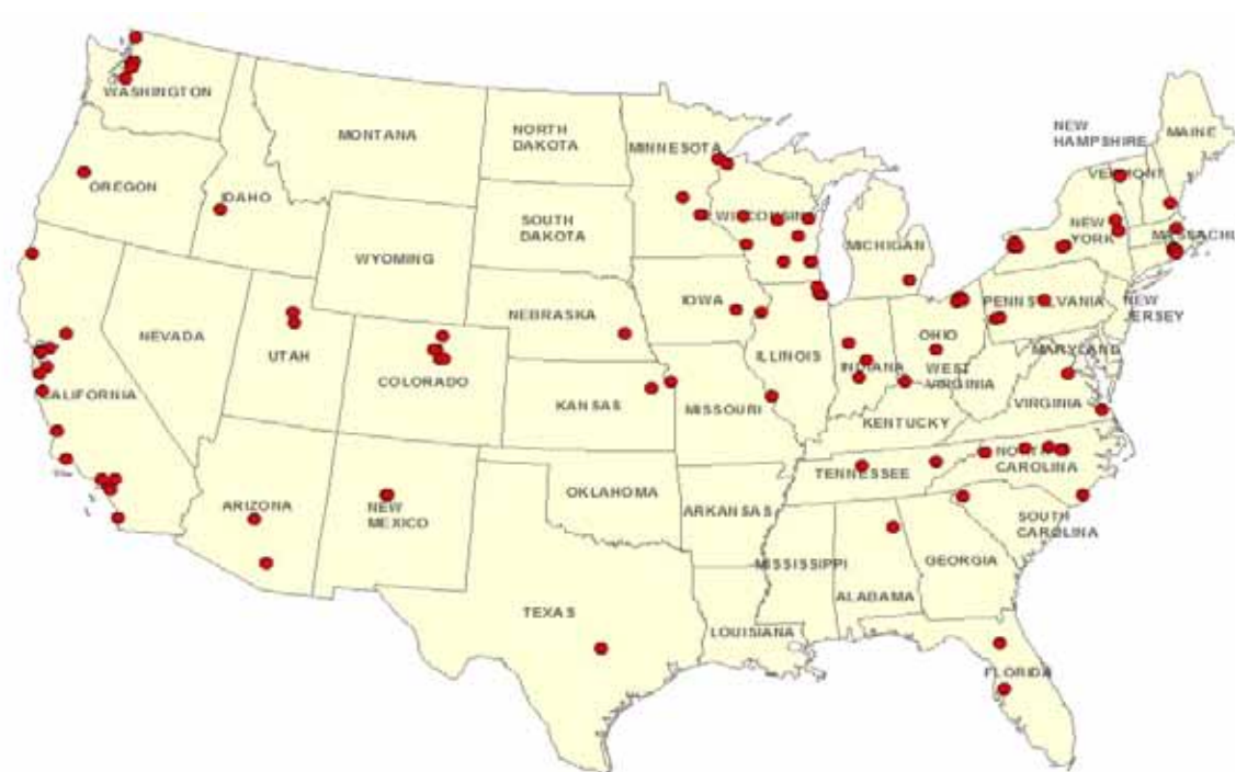
Figure 1. Colleges and Universities with U-Pass, Transit Discount or Fare-Free Transit Programs in the Conterminous United States 21

Other colleges and universities augment local transit service by providing private, university-run shuttle buses. A