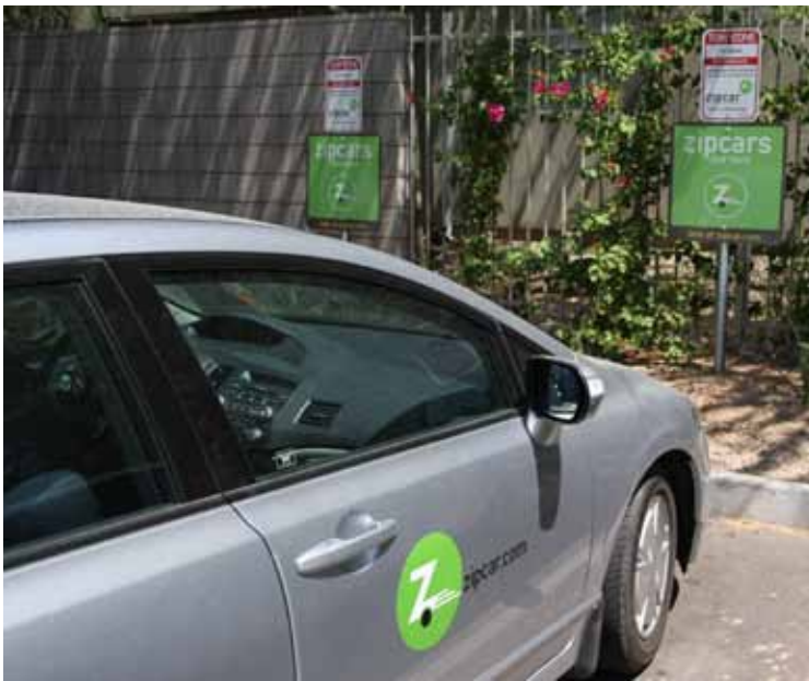
Shared vehicles, like this Zipcar parked at Arizona State University's campus in Tempe, Arizona, are available for students and staff to rent at hundreds of colleges and universities in the United States.

The Massachusetts Institute of Technology (MIT) is one campus that has