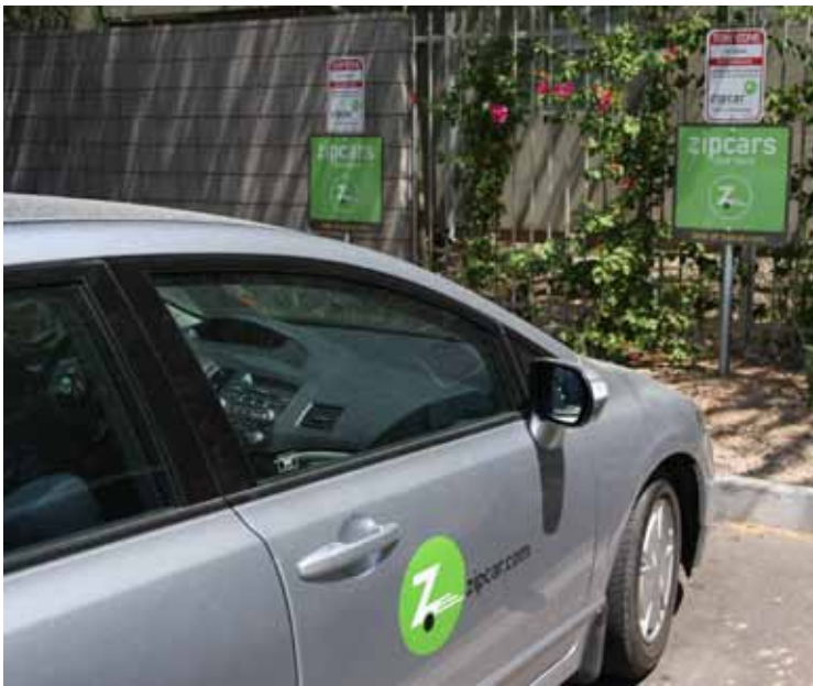
Shared vehicles, like this Zipcar parked at Arizona State University's campus in Tempe, Arizona, are available for students and staff to rent at hundreds of colleges and universities in the United States.

The Massachusetts Institute of Technology (MIT) is one campus that has