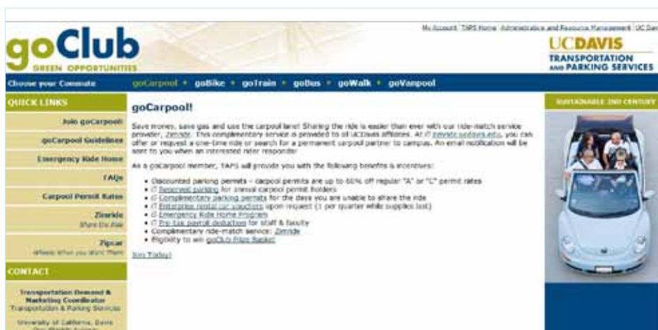
UC-Davis promotes its carpool program online.