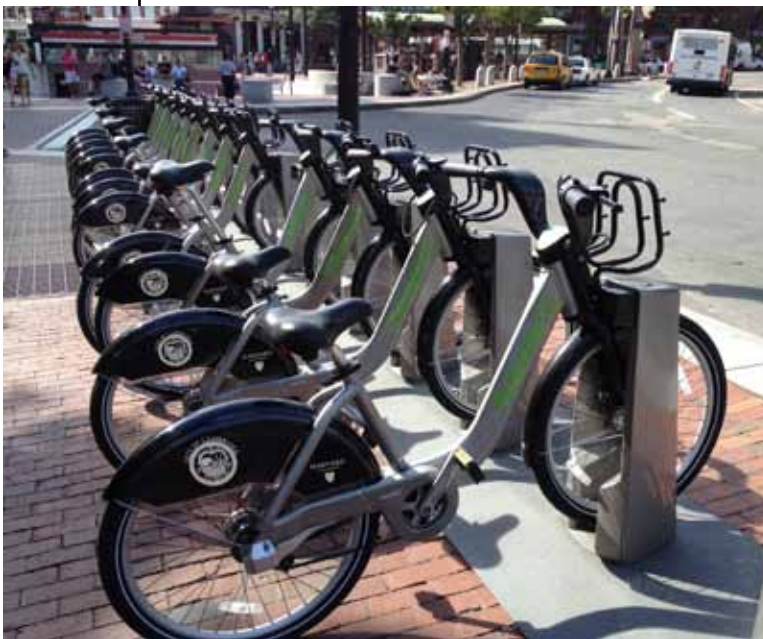
The Hubway bikeshare program is increasingly popular at Harvard University.

more members will join. The more members there are, the more our community will see bicycles and bikeshare as a viable and safe transportation option for traveling to and within our campus. That will in turn attract even more members and spur the building of more stations. We've seen it here at Harvard, and I hope to see it throughout the whole region." Other educational institutions in the area supporting Hubway include Northeastern University, the University of Massachusetts Boston, College of the Fenway and Massachusetts Institute of Technology. 61