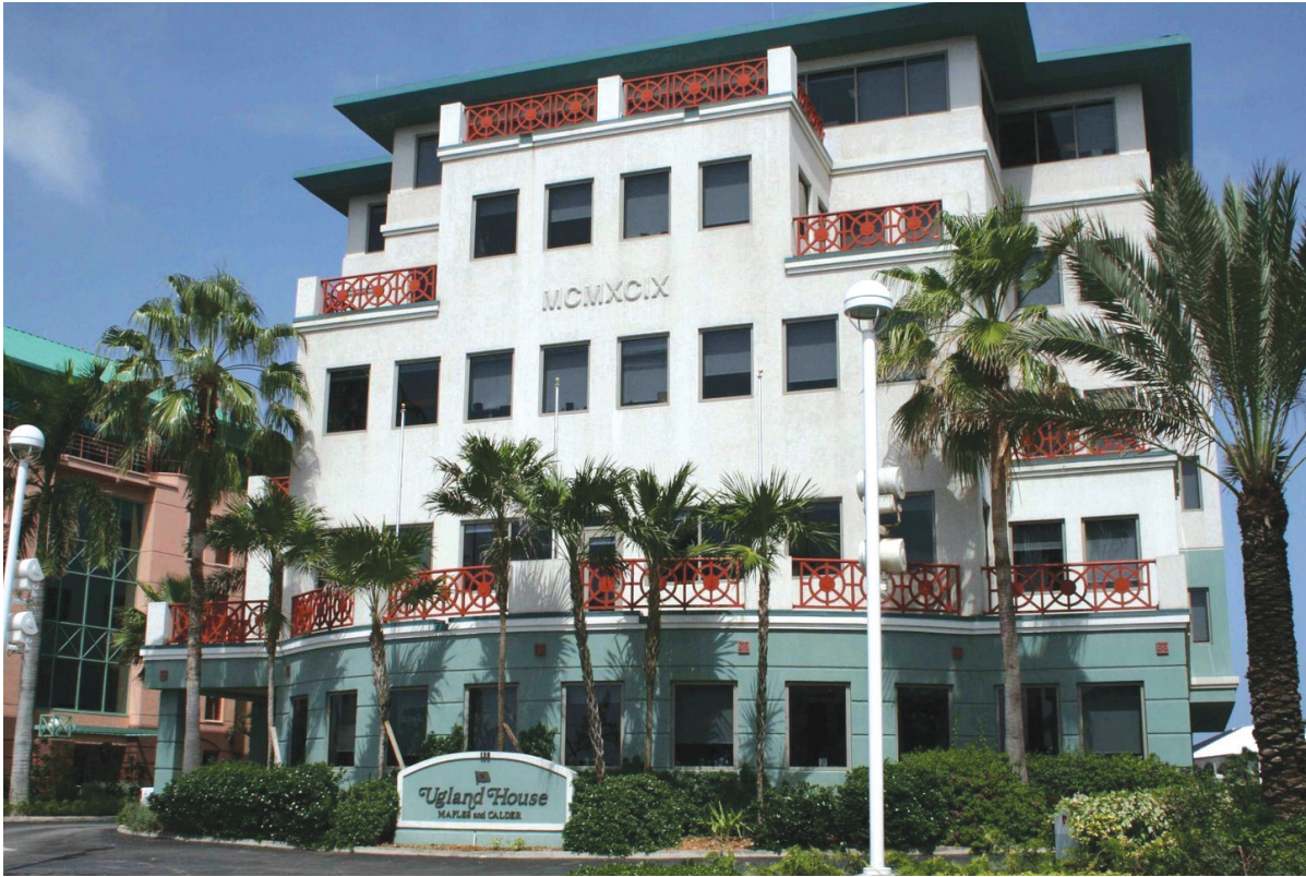
18,857 companies register their address in this small office building in the Cayman Islands.

Small business owners, along with ordinary Americans, pick up the tab either by paying higher taxes, suffering from cuts to public programs, or facing a larger national debt. And without access to offshore subsidiaries, small businesses and medium-sized domestic businesses are put at an unfair competitive disadvantage and forced to compete on an uneven playing field.