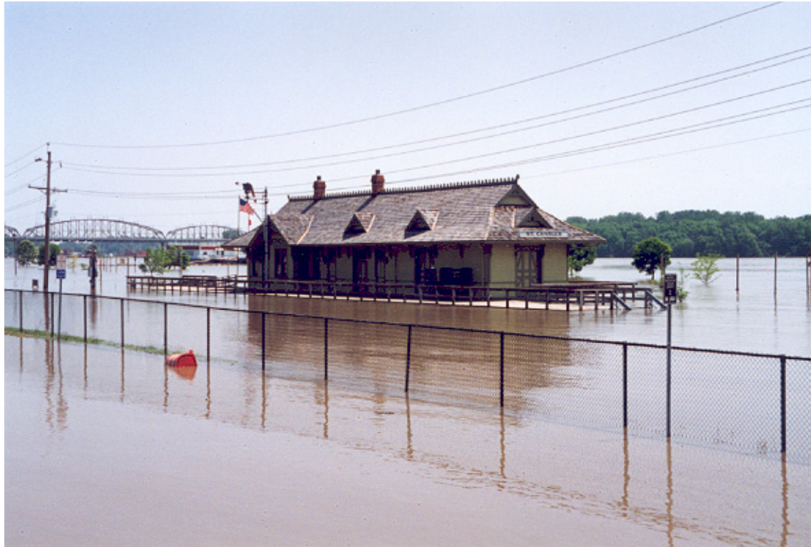
The 1993 Mississippi River Flood devastated numerous communities along the river's route, including St. Charles, MO, pictured here.

common since the first part of the 20 th century, with the greatest changes in the Northeast and the Midwest. 16 Greater changes are in store for the decades ahead.