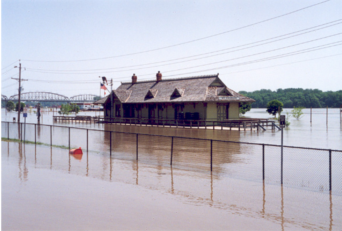
The 1993 Mississippi River Flood devastated numerous communities along the river's route, including St. Charles, MO, pictured here.

common since the first part of the 20 th century, with the greatest changes in the Northeast and the Midwest. 16 Greater changes are in store for the decades ahead.