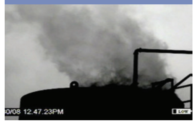
Methane leaks are invisible to the naked eye (above), but infrared imagery can reveal methane leaks (below), such as from this natural gas storage tank.

Every pipe joint at a wellhead the potential to leak methane.