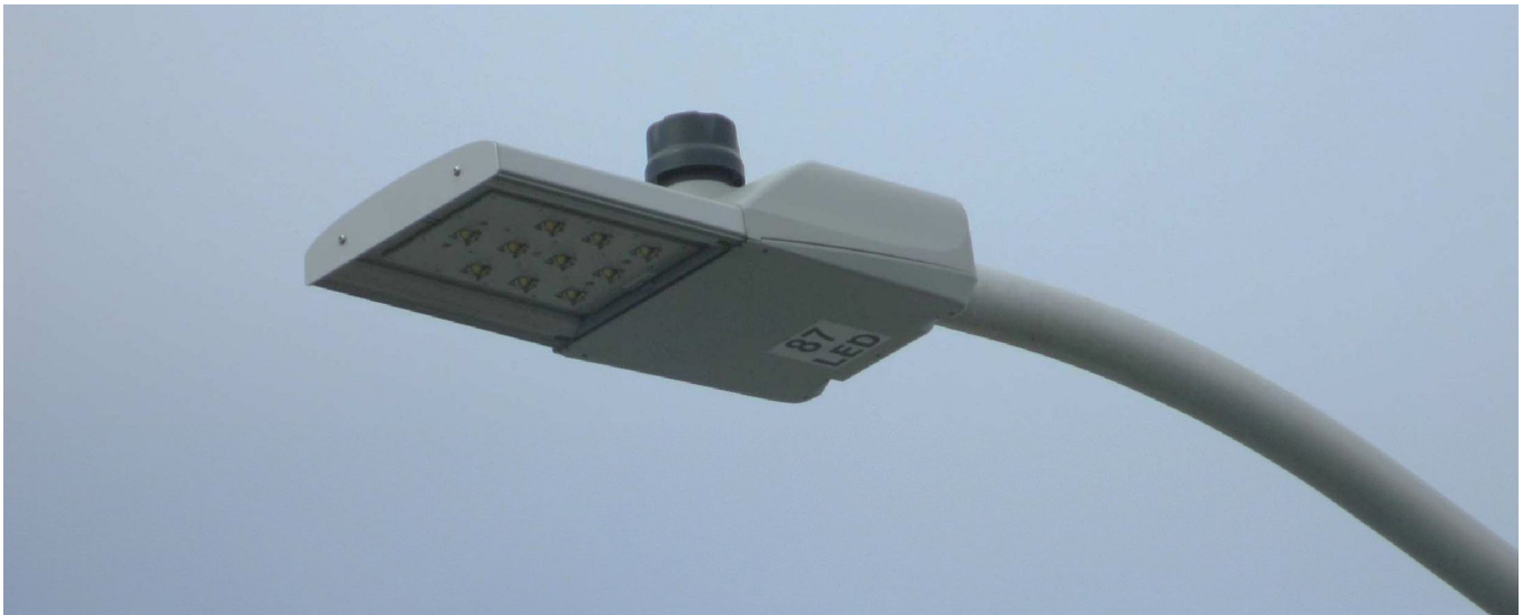
LED streetlights like this one will save the towns of Swampscott and Wenham more than $100,000 in energy costs every year.

As of December 2015, 155 towns and cities – home to more than half of the Massachusetts population – have earned the Green Communities designation, and so far $29 million in Green Communities grant money has been put to use through the Massachusetts Department of Energy Resources to help communities reduce environmental impacts. 47 Many cities and towns around Massachusetts have chosen to save money by installing LED streetlights through the program, including in the towns of Swampscott and Wenham.