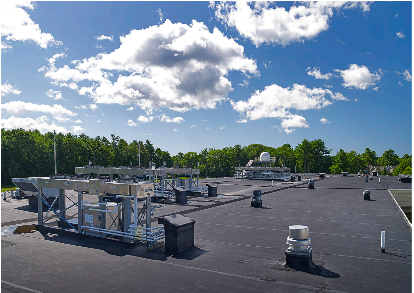
Funding from Efficiency Maine helped Oxford Networks install new high-efficiency cooling systems at its data center in Brunswick, part of efficiency upgrades that are saving Oxford Networks between $3,000 and $5,000 per year in energy costs.

Maine is already feeling the effects of climate change. Since the 19 th century, Maine's average temperature has increased by 3.0°F. This temperature rise has brought about impacts including more Lyme disease, altered maple syrup schedules, shorter winters, and threats to Maine's iconic wildlife, including moose. 69 In coming together to meet these challenges, Maine businesses are also finding opportunities to modernize their operations and save money – including businesses on the cutting edge of modern information technology.