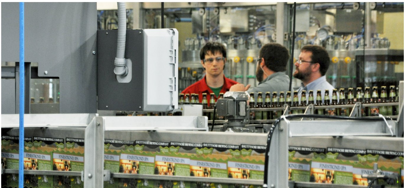
Efficient equipment at the new Smuttynose Brewhouse in Hampton will save 11 million kWh of energy saved over equipment lifetime, equivalent to the energy needed to power 1,500 homes for a year.

In part due to the efficiency measures built through work with RGGI proceeds, the Smuttynose Brewing Company was certified LEED Gold, the second-highest certification possible through the Leadership in Energy and Environmental Design green building certification program.