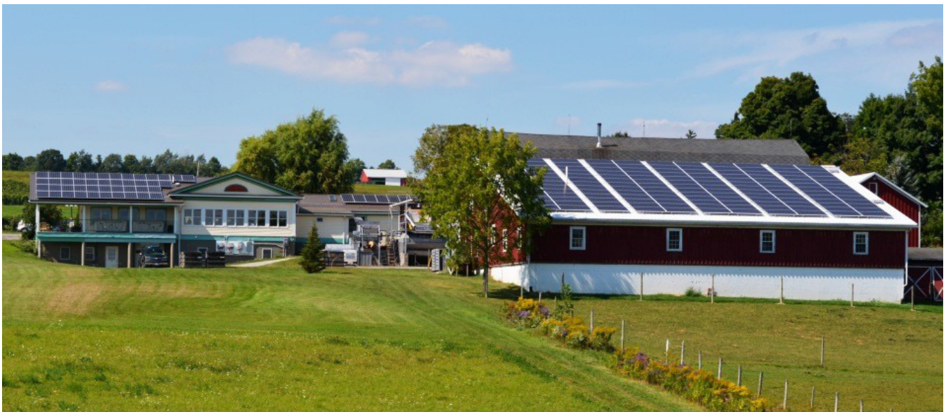
With help from the New York Green Bank, Hunt Country Vineyards installed 348 rooftop solar panels.

New York has set an ambitious goal, consistent with the Paris Climate Agreement, of reducing global warming pollution by 40 percent below 1990 levels by 2030. 25