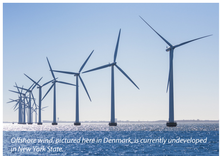
Offshore wind, pictured here in Denmark, is currently undeveloped in New York State.

New York State has the potential to produce enough power with onshore and offshore wind turbines to power all of the homes in New York State 11 times over .