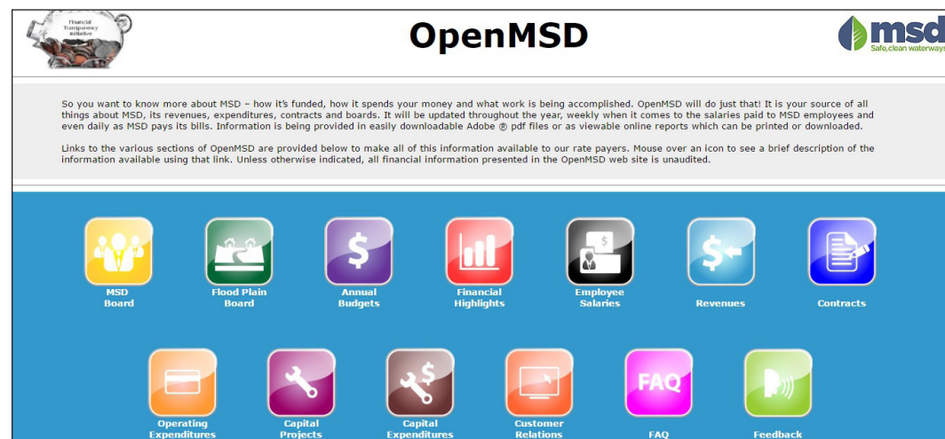
Figure 2. The Louisville-Jefferson County Metropolitan Sewer District Offers a Transparency Portal Hosting All District Financials in One Place

Ideally, even special districts that report financial information elsewhere should