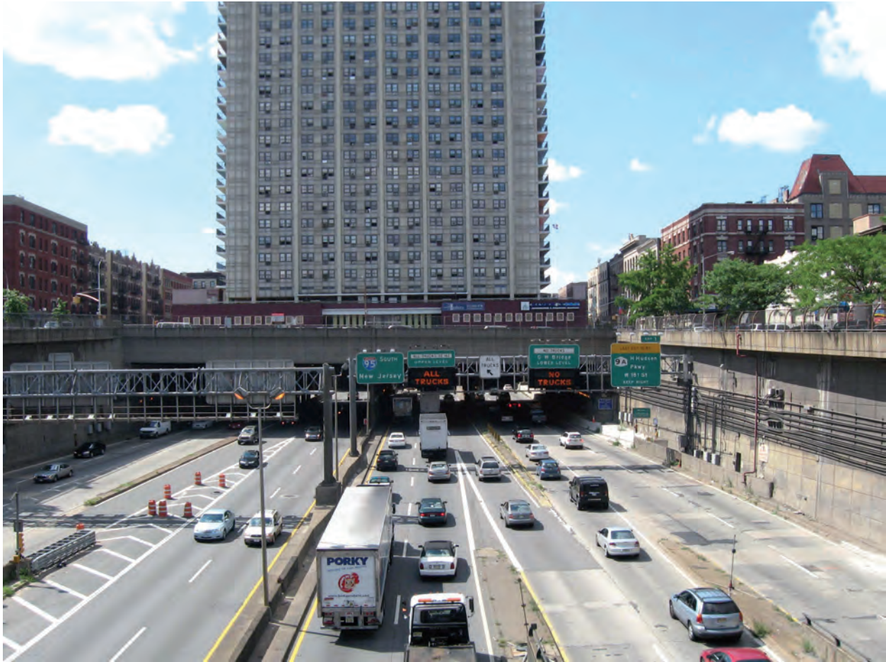
An apartment building has been built above the Trans-Manhattan Expressway in New York City. Living near a highway raises the risk of developing lung cancer, and of dying from stroke, lung disease and heart disease.

cough, wheezing, runny nose and asthma. 44 People living near highways or highly traveled roads face an increased risk of developing lung cancer, and a greater risk of death from stroke, lung disease and heart disease. 45 More than 11 million Americans live within 500 feet of a major highway. 46