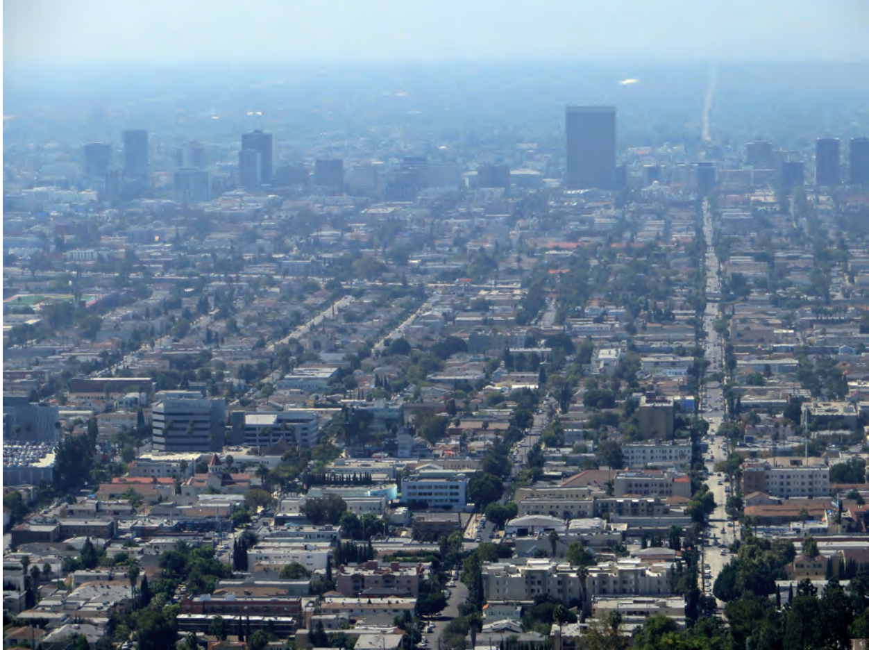
Air pollution over Los Angeles, 2014.

chronic pollution. The Denver, Phoenix, Las Vegas, Salt Lake City and Albuquerque metropolitan areas along with two regions in Texas – Houston and Dallas-Fort Worth – were also among the cities that faced frequent exposure to elevated levels of smog.