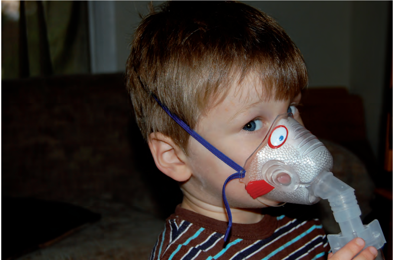
Children are especially vulnerable to ozone's effects.