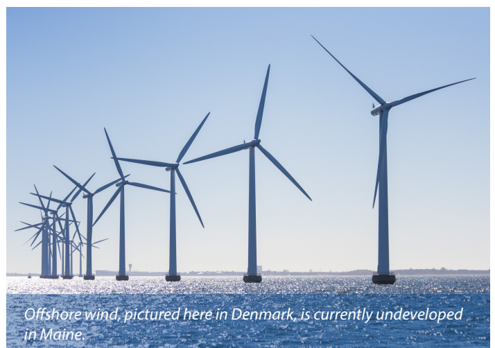
Offshore wind, pictured here in Denmark, is currently undeveloped in Maine.

Maine has the potential to produce enough power with onshore and offshore wind turbines to power all of the homes in Maine more than 100 times over .