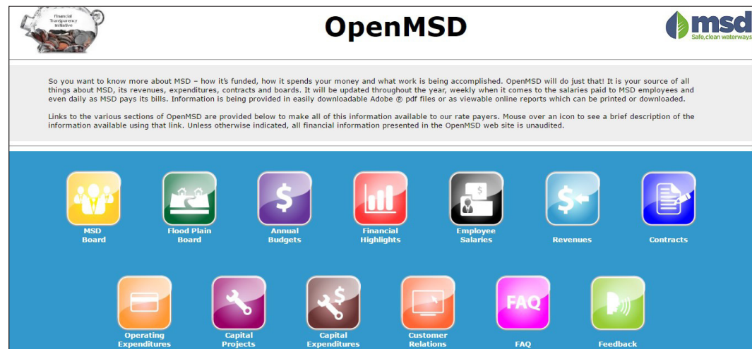
Figure 2. The Louisville-Jefferson County Metropolitan Sewer District Offers a Transparency Portal Hosting All District Financials in One Place

Ideally, even special districts that report financial information elsewhere should