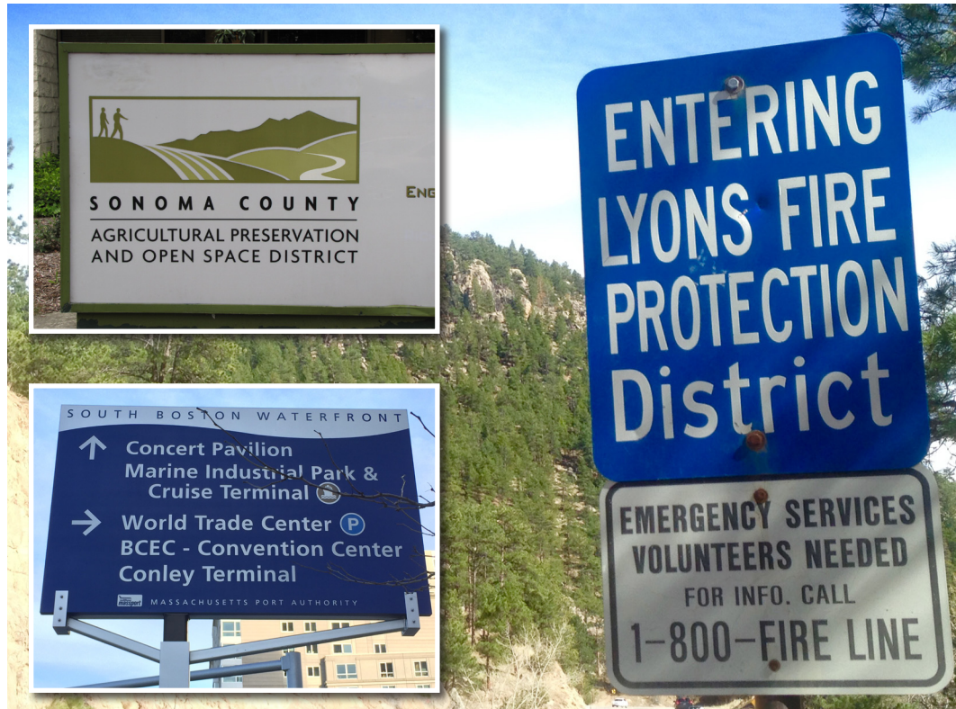
Signage for the Lyons Fire Protection District of Colorado, the Sonoma County Agricultural Preservation and Open Space District of California, and the Massachusetts Port Authority in Boston.

A perhaps more significant use of special districts emerged after the financial crisis of the 1870s. Cities left with high levels of debt after extensive borrowing during the preceding economic boom responded by passing limits on public debt to avoid future defaults. These limitations led some to fear that governments would simply raise taxes, causing some groups to successfully lobby for limitations on additional taxation. As a result, local governments were left in a fiscal bind – unable to raise taxes and faced with low debt ceil-