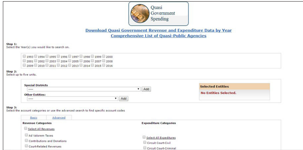
Figure 5. Florida’s State Transparency Portal Includes a Dedicated Portal for Special District Financials

The Special District Leadership Foundation, a California non-profit created to help encourage best practices among the state’s special districts, offers a District Transparency Certificate of Excellence. The program requires special district offi-