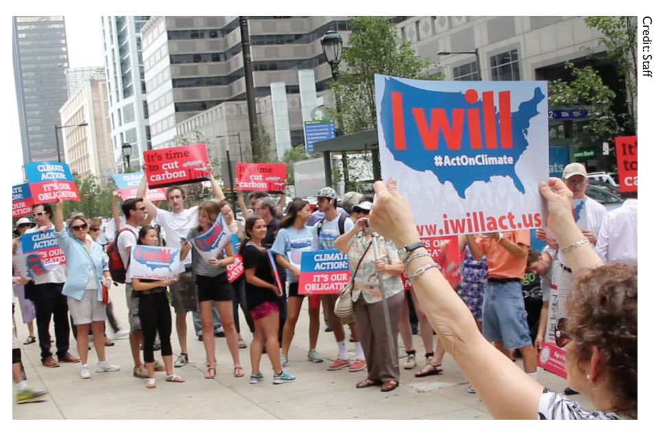
▲ Supporters turned out to a rally during the Clean Power Plan day of action on July 30.

Showing an outpouring of public support for state-level clean energy policies, such as renewable energy standards, fuel efficiency standards, carbon caps and more, will be essential to the overall success of the Clean Power Plan.