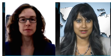
How Fracking Impacts the Most Vulnerable Among Us

The legacy of hydrocarbon extraction and the rapid spread of fracking across the U.S. over the last decade have caused widespread harm to our environment and our health. By limiting fracking and ensuring that all oil and gas production is tightly regulated, the nation can take the first steps toward healing the damage.