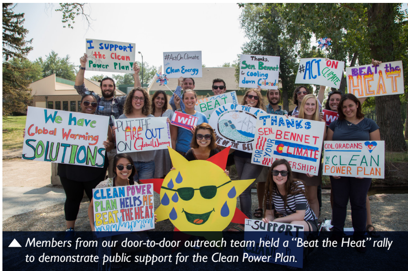
▲ Members from our door-to-door outreach team held a “Beat the Heat” rally to demonstrate public support for the Clean Power Plan.

You should carefully consider the Funds' investment objectives, risks, charges and expenses before investing. To obtain a Prospectus that contains this and other information about the Funds, please email info@greencentury.com , call 1-800-93-GREEN, or visit www.GreenCentury.com . Please read the Prospectus carefully before investing. The Green Century Funds are distributed by UMB Distribution Services, LLC. 11/13.