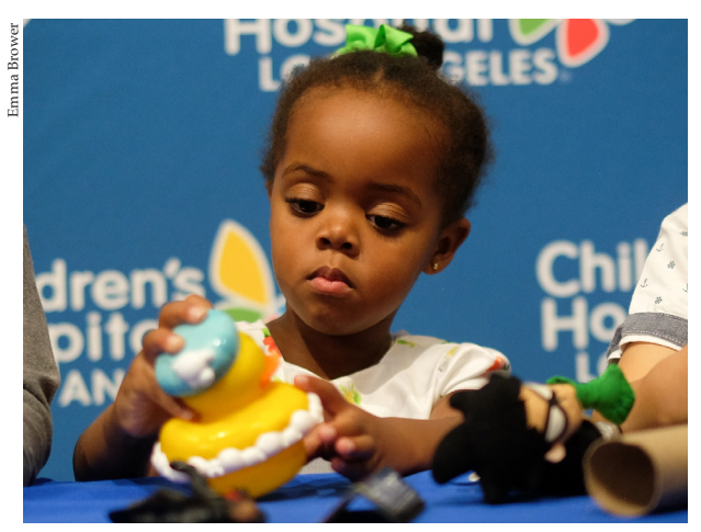
SAFETY FIRST FOR TOYS —Doctors and hospital staff joined our sister group CALPIRG Education Fund at the Children's Hospital in Los Angeles, Calif., to release the report "Trouble in Toyland" while children played with safe toys.

We should know if the toys we buy for our children and our families are safe—whether we buy them at stores or online. That's why, for 31 years, NJPIRG Law & Policy Center has released the "Trouble in Toyland" report, looking at safety hazards including toxic toys, choking hazards and more to make sure your family has the resources they need to avoid dangerous toys.