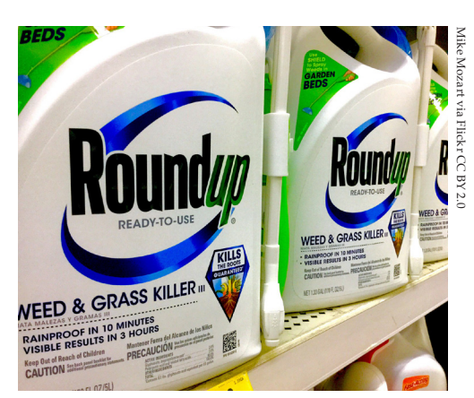
BAN ROUNDUP NOW—We're calling on the EPA to ban Roundup, to protect public health and the environment.

One study by the WHO linked glyphosatethe main chemical ingredient in Roundup-to cancer at high levels of exposure. However, Roundup is not just glyphosate, it's a cocktail of different chemicals and there's mounting evidence that this cocktail could be a dangerous one for our health. On top of that, Roundup has become the most widely-used agricultural