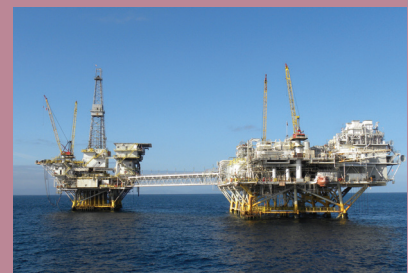
Top: Environment Maine and our allies delivered more than 2.7 million public comments to the Department of the Interior, calling on them to save our monuments.