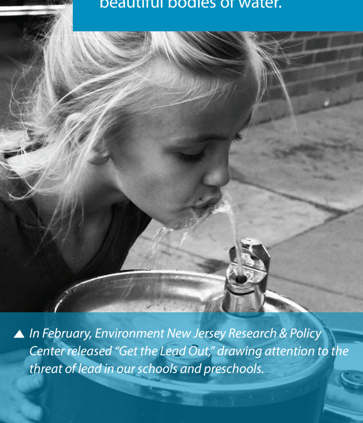
▲ In February, Environment New Jersey Research & Policy Center released “Get the Lead Out,” drawing attention to the threat of lead in our schools and preschools.

Water is life. Environment New Jersey is committed to keeping the waters we love and rely on clean, safe and beautiful. When the Trump administration moved to roll back the Clean Water Rule, we stood up to protect it. Through our Get the Lead Out campaign, we worked to keep drinking water safe, especially for our children. And our Clean Water Network provided organizers and advocates with the resources they needed to protect our most beautiful bodies of water.