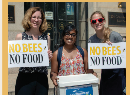
Top: Our national network held events all over the country to raise awareness about the importance of bees and the problems they face.