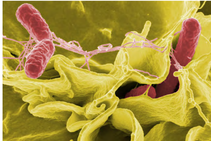
Color-enhanced scanning electron micrograph showing Salmonella Typhimurium (red) invading cultured human cells.

their life or 100,000 people losing 1 year of their life, or another variation. While some of these incidents are caused by unsafe food preparation, gaps in the safety of our food supply contributes to the risk of contamination and increases the number of those affected in the United States every year.