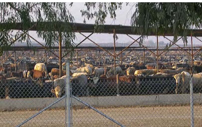
Harris Ranch feedlot in California.

The complicated interconnections and opacity of the food supply chain has made tracking the source of the contamination extremely arduous. It could take weeks to locate the source of an outbreak in something like fruit and vegetables by which time dozens of people could have gotten sick because the food is perishable. Delays risk serious health consequences and point to the need to streamline the process of agriculture supply chain transparency. Transaction information can be vital to containing the public health impacts of contamination.